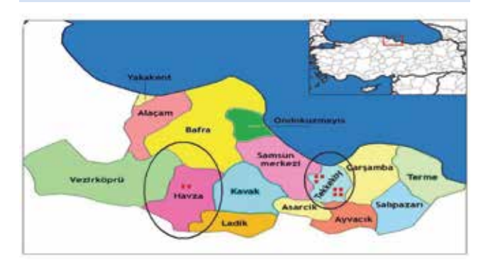
Figure 1. Sampling areas (each red dot represent one herd)

Sevik (2013) has reported that female animals had higher antibody responses to inactivated FMD vaccine than male animals, but we did not detect any differences between male and female goats in terms of sex susceptibility for FMD.