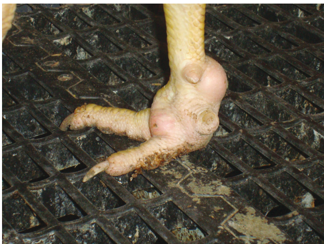
Fig. 1. Pathological findings in the foot pad of broiler breeders; visible joint lesion typically unilateral in distribution, with swelling and warm.

age of 60 weeks, were below the standards of that bird strain. Total egg production was 9% below that, hatchability 4% below that and total chick production was 15% below that. Total mortality rate in the flock was 15%.