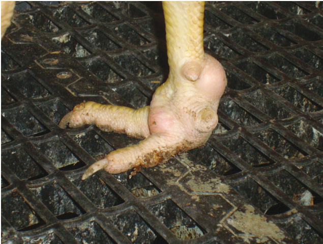
Fig. 1. Pathological findings in the foot pad of broiler breeders; visible joint lesion typically unilateral in distribution, with swelling and warm.

age of 60 weeks, were below the standards of that bird strain. Total egg production was 9% below that, hatchability 4% below that and total chick production was 15% below that. Total mortality rate in the flock was 15%.