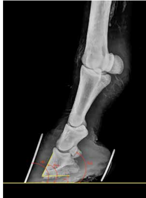
Figure 2. Lateromedial radiographic view of a forefoot of donkey showed the hoof angle parameter recorded by the DICOM. P3A: P3 angle; NA: Navicular Angle; HA: Hoof Angle; P3BA: P3 bottom angle.

omy of donkey forefeet. It provides new data regarding the digital bone and hoof parameters in sound donkeys. Thus, the diagnosis of anatomical change cannot be based on standard data previously assumed for the horse and should be evaluated correspondingly for the donkey. The mean \pm SD of the digital bone and hoof parameters in sound donkeys was different to that of horses, according to Rocha et al., 2004 and Masoudifard et al., 2014. This could be attributed to different occupation, anatomical variation in body size, height and weight, shoeing policies and genetics of horses and donkeys that can have an influence on hoof confirmation. In addition, the natural habitat in which the domestic donkey's ancestor's evolved (mountainous, arid areas with narrow paths) is well suited to the narrow, upright hoof anatomy. Thus, given that the digital bone and hoof parameters varies among equidae, it is important to establish a guideline interval for the digital bone and hoof parameters in each individual species.