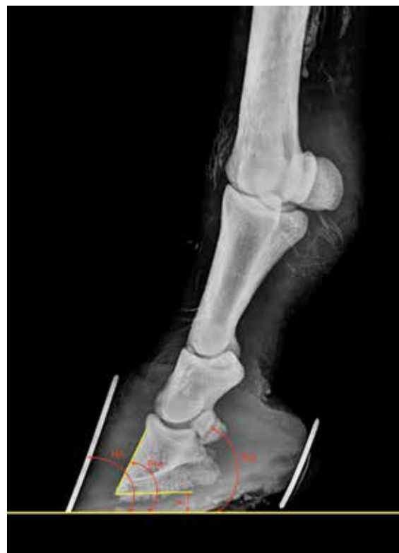
Figure 2. Lateromedial radiographic view of a forefoot of donkey showed the hoof angle parameter recorded by the DICOM. P3A: P3 angle; NA: Navicular Angle; HA: Hoof Angle; P3BA: P3 bottom angle.

my of donkey forefeet. It provides new data regarding the digital bone and hoof parameters in sound donkeys. Thus, the diagnosis of anatomical change cannot be based on standard data previously assumed for the horse and should be evaluated correspondingly for the donkey. The mean \pm SD of the digital bone and hoof parameters in sound donkeys was different to that of horses, according to Rocha et al., 2004 and Masoudifard et al., 2014. This could be attributed to different occupation, anatomical variation in body size, height and weight, shoeing policies and genetics of horses and donkeys that can have an influence on hoof confirmation. In addition, the natural habitat in which the domestic donkey's ancestor's evolved (mountainous, arid areas with narrow paths) is well suited to the narrow, upright hoof anatomy. Thus, given that the digital bone and hoof parameters varies among equidae, it is important to establish a guideline interval for the digital bone and hoof parameters in each individual species.