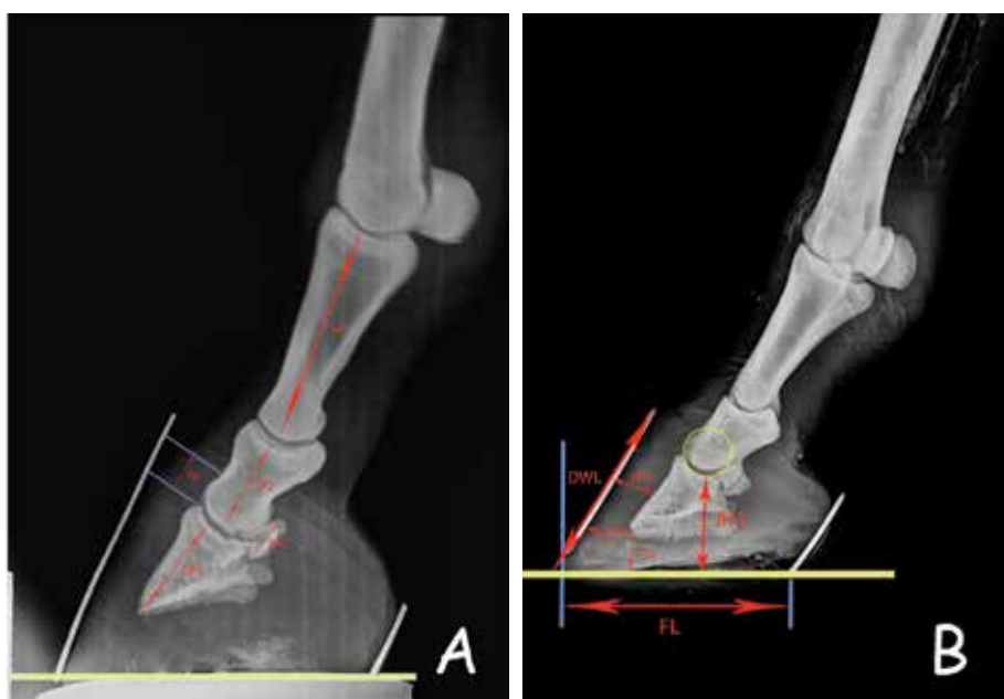
Figure 1. Lateromedial radiographic view of a forefoot of donkey showed the digital bone parameter recorded by the DICOM. (A): LP1: length of the first phalanx (P1); LP2: length of the second phalanx (P2); LP3: Length of third phalanx (P3); NW: Navicular bone width; FD: Founder Distance. (B): P3G: Tip of P3 to the ground; P3T: Tip of P3 to toe; JH3: P2-P3 joint height; FL: Foot width; HP3: Hoof-P3 distance; DWL: Dorsal wall length.

*Value differs significantly ( P < 0.05 ) from the corresponding value for the digital bone and hoof parameters of donkeys. See Table 2 for remainder of key.