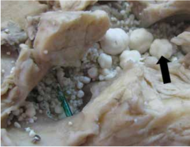
Figure 1. A large numbers of white stones (arrow) with rough surfaces and different sizes are observed within the dilated pancreatic duct.