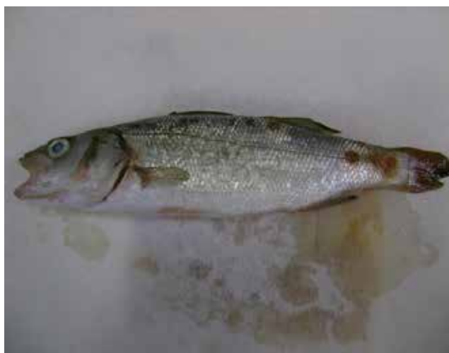
Figure 2. Sea bass affected by tenacibaculosis. Pale yellow lesion and necrosis of the caudal fin.