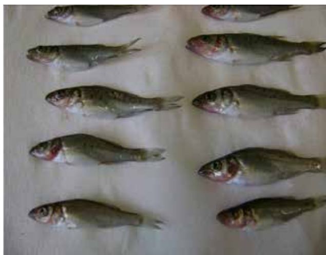
Figure 4. Sea bass affected by tenacibaculosis. Hemorrhage mouth, haemorrhage stomatitis.