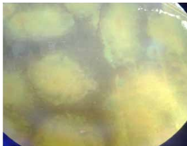
Figure 6. Yellow colonies, with uneven edges of T. maritimum , from the skin on FMM agar.