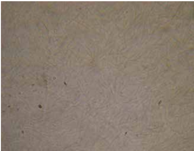
Figure 1. Long and slender rods Tenacibaculum maritimum in smears ( x1000 objective).

The first serological studies described by Wakabayashi et al. (1984) and Pazos et al. (1993), reported antigenic homogeneity of T. maritimum , regardless of their origin and source of isolation. Further studies by Pazos (1997) and Ostland et al. (1999) demonstrated antigenic differences among T. maritimum isolates, suggesting that this microorganism may not be as homogeneous as previously thought. Further studies are necessary, since a clear definition of antigenic knowledge of this bacterium is of crucial importance for the development of an effective vaccine (Avendaño-Herrera et al., 2004a; Romalde et al., 2005).