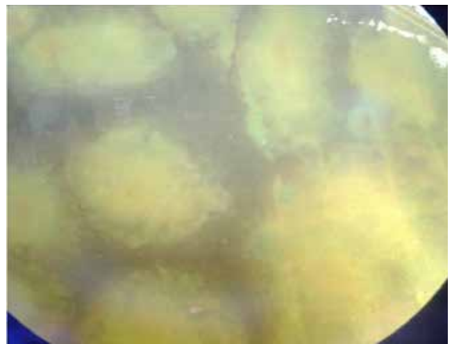
Figure 6. Yellow colonies, with uneven edges of T. maritimum , from the skin on FMM agar.