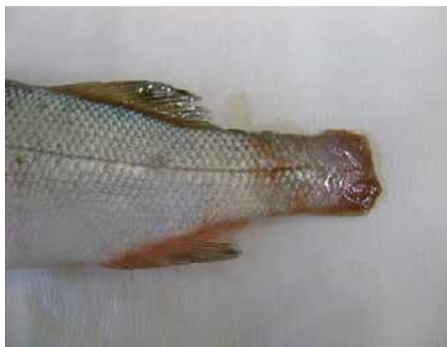
Figure 3. Sea bass affected by tenacibaculosis. Necrosis and fray of the caudal fin.