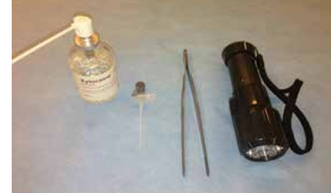
Figure 2. Materials for endotracheal intubation in small rodents. Papastefanou, A.et al., 2014.