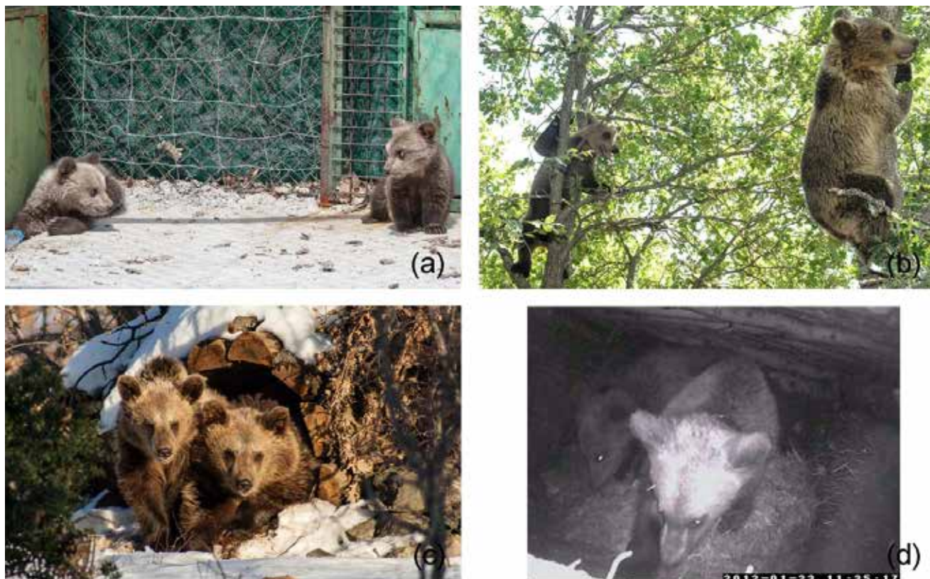
Figure 1. Various images of the first two brown bears successfully rehabilitated and released in Greece. a. The cubs in their small, fenced area (at the age of 2-3 months); b. The cubs climbing on trees in their forest enclosure (at the age of 6-7 months); c. The cubs at their den (at the age of 10-11 months) in the rehabilitation centre; d. Image from the infrared camera from the inside of the winter den, where the two cubs were released, right after recovery from anaesthesia.