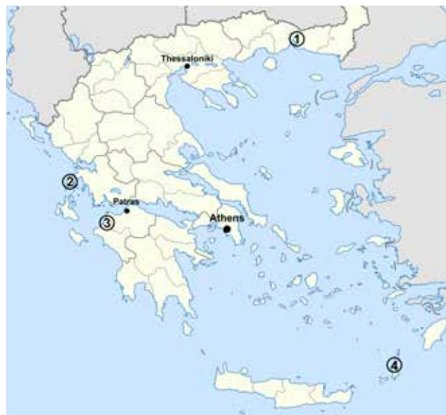
Figure 1. Sampling sites of this study for the detection of Batrachochytrium dendrobatidis in freeliving anurans in Greece. 1) Lake Vistonida 2) Lefkada island 3) Strofylia/Kotychi lagoon 4) Karpathos island

All capture activities were part of a broader national amphibian monitoring project and the field researchers had the required permits to enter protected areas and sample specimens. From each wetland, an effort was made to include as many species as possible, and to sample at least 10 individuals per species per location. Amphibians were caught by hand or by net during the evening hours. To prevent cross-contamination between animals, a new pair of disposable, non-powdered vinyl gloves was worn for the capture and handling of each animal from each site and the net and field equipment was disinfected with Virkon® (Antec International) and rinsed with fresh water between each capture site. Each animal caught was immediately sampled noninvasively with a sterile cotton-tipped metal swab (Böttger, Bodenmais, Germany). Each flank, inner thigh, web of hind legs and ventral