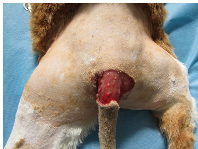
Figure 1. A rectangular wound measured 5 x4 cm at the base of the tail of a 2,5 year old DSH cat.

muscle taking care to preserve cutaneous vasculature and the edge of the flap was rotated to cover half of the wound. The other half was closed by a flap elevated from the other end of the wound. The flaps were sutured together in the midline and to the skin of the tail with simple interrupted 3/0 poliglecaprone 25 suture material placed subcutaneously. Two other continuous sutures were placed subcutaneously between the wound sides and the flaps. The skin was closed with continuous 3/0 polyamide suture to complete the closure. No drain was placed. The cat made an uneventful recovery from anesthesia and discharged from the hospital 2 days after surgery. An Elizabethan collar was placed and postoperative