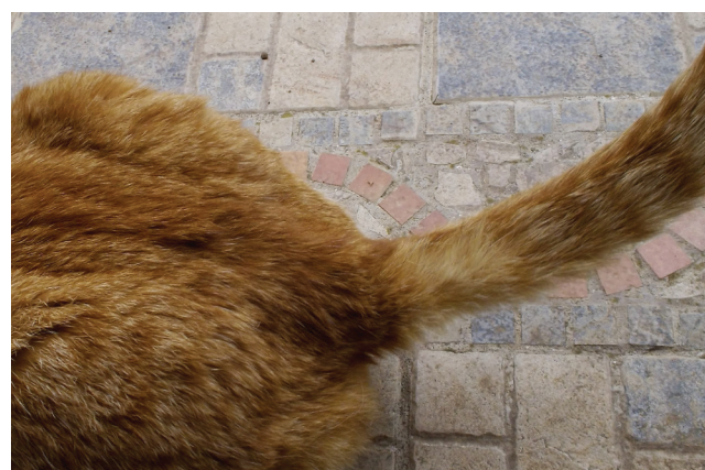
Figure 4. The lumbosacral and tail region of the cat of figure 1 12 months after surgery.