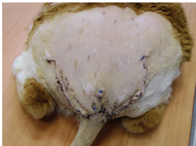
Figure 4. The wound of the cat of figure 1 twelve days after surgery at suture removal.