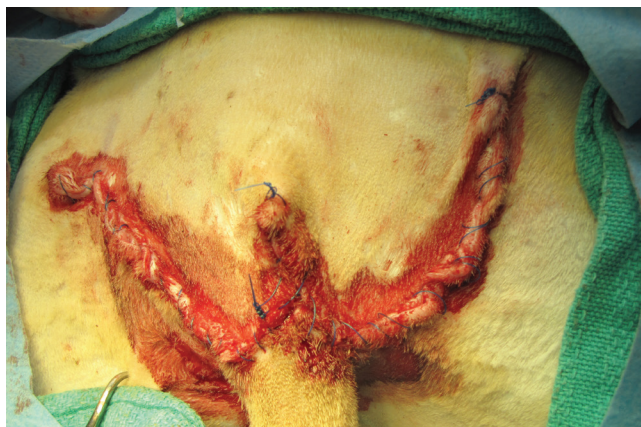
Figure 4. The wound of the cat of figure 1 was closed with continuous polyamide sutures