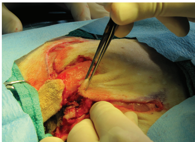
Figure 3. The two flaps were elevated and mobilized to cover the wound of the cat of figure 1.

Axial pattern flaps are pedicle flaps that incorporate a direct cutaneous artery and vein. The caudal superficial epigastric flap may be considered to cover tail base wound in cats; creation of a long epigastric flap with less distance needed to cover the tail base wound would be an option in our case (Remedios et al., 1989, Bellah, 2006). However, the extensive dissection of the donor side and the difference in cosmetic appearance of the recipient versus donor sides made this technique less desirable to close the wound in our case (Nelissen and White, 2014). Free