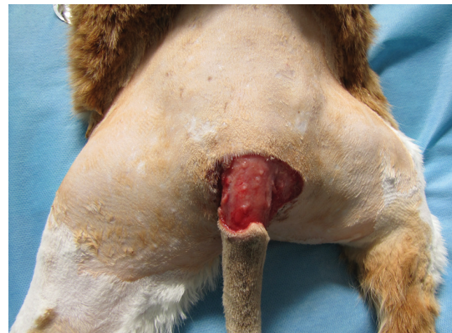
Figure 1. A rectangular wound measured 5 x4 cm at the base of the tail of a 2,5 year old DSH cat.

muscle taking care to preserve cutaneous vasculature and the edge of the flap was rotated to cover half of the wound. The other half was closed by a flap elevated from the other end of the wound. The flaps were sutured together in the midline and to the skin of the tail with simple interrupted 3/0 poliglecaprone 25 suture material placed subcutaneously. Two other continuous sutures were placed subcutaneously between the wound sides and the flaps. The skin was closed with continuous 3/0 polyamide suture to complete the closure. No drain was placed. The cat made an uneventful recovery from anesthesia and discharged from the hospital 2 days after surgery. An Elizabethan collar was placed and postoperative