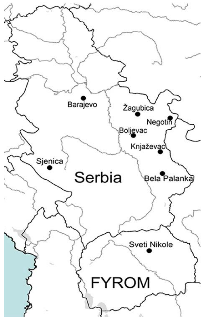
Figure 1. Map with localities in Serbia and Former Yugoslav Republic of Macedonia where wolves were hunted during 2009-2011.