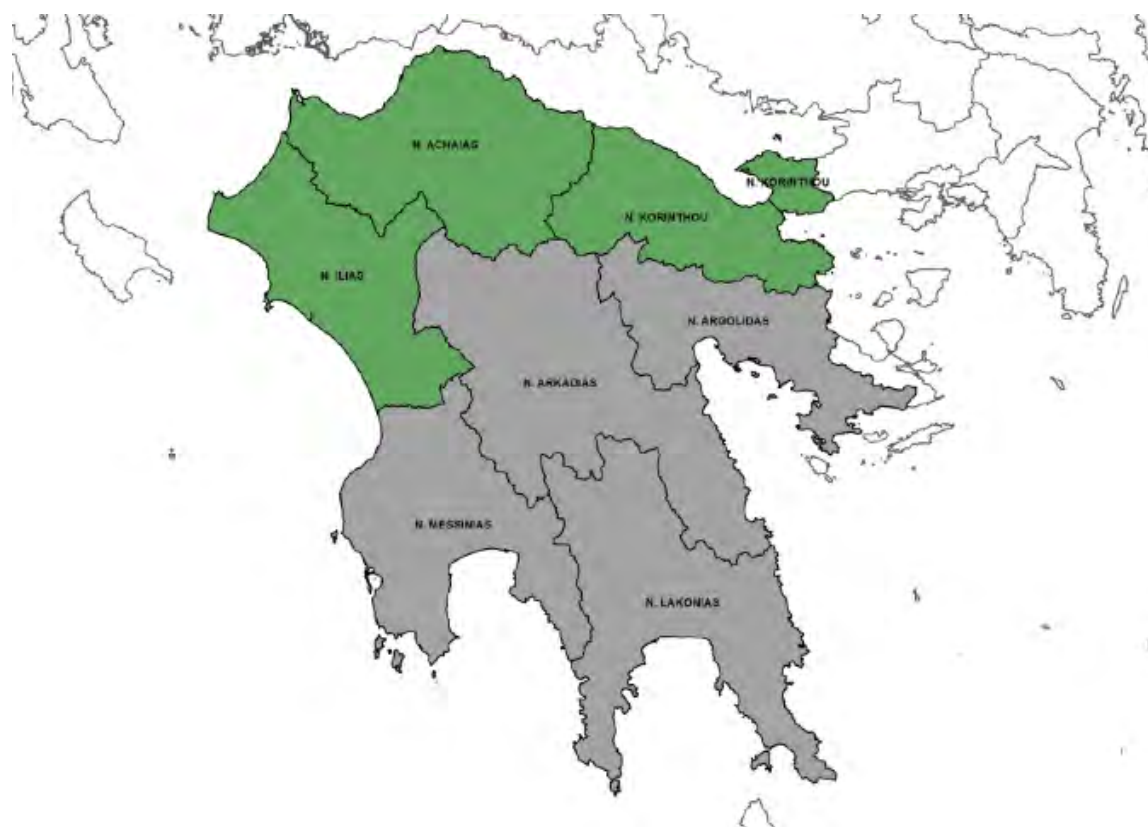
Fig 1. The study area

(Figure1), which according to retrieved data from Hellenic Statistic Authority (HSA), for the year 2010 accommodate 4.000 sheep farms consisting the 10% of the total exclusive sheep farmers of Greece. Among them only the 176 exclusive sheep farmers are routinely controlled by the local quality control laboratory of HAO-DIMITER representing the 4.4% of the area sheep farmers. Out of them 128 were surveyed. The farmers' participation was voluntary and the participants hold the right to withdraw consent at any time, without excuse.