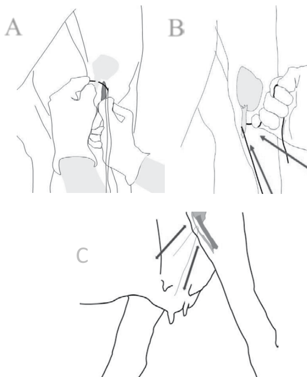
Fig 1: The surgical procedure in donkeys in standing position on the top; insertion of needle, A and splitting of the ligament, B, and in cattle in lateral recumbency with the affected limb above, at the bottom, C.

surgical site) for each procedure was recorded. Post-operative assessment was based on daily examination of animals for lameness signs, presence of gross signs of inflammation such as “swelling, hotness, pain and redness”.