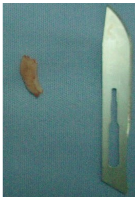
Fig 2: Fragment of the 7 th metacarpophalangeal sesamoid after total sesamoidectomy (Case 2).

Given the chronicity and relapses of the condition, sesamoidectomy was the choice of treatment. A Robert Jones bandage was applied for 10 days. Amoxicillin plus clavulanic acid (15 mg/kg b.w., p.o., BID, for 6 days) and caprofen (2.2 mg/kg b.w., p.o., SID, for 5 days) were given post-operatively.