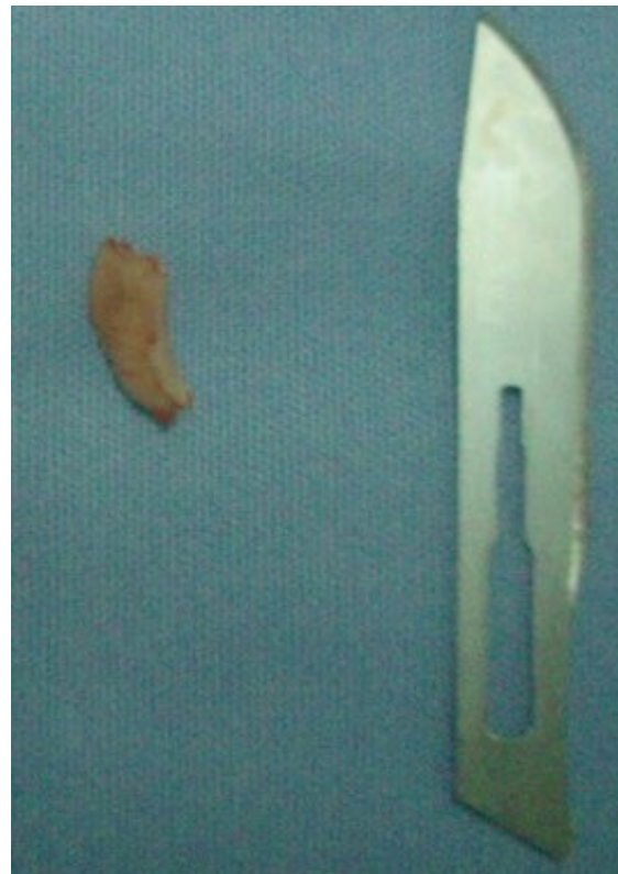
Fig 2: Fragment of the 7 th metacarpophalangeal sesamoid after total sesamoidectomy (Case 2).

Given the chronicity and relapses of the condition, sesamoidectomy was the choice of treatment. A Robert Jones bandage was applied for 10 days. Amoxicillin plus clavulanic acid (15 mg/kg b.w., p.o., BID, for 6 days) and caprofen (2.2 mg/kg b.w., p.o., SID, for 5 days) were given post-operatively.