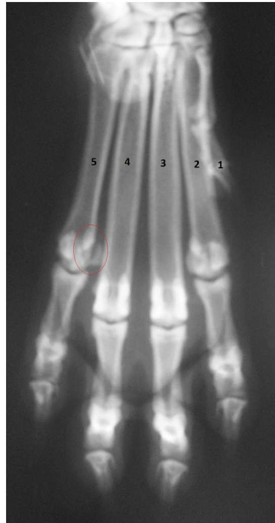
Fig 1: Dorsoventral radiographic view of a comminuted fracture with mild medial displacement of the 7 th sesamoid bone at the 4 th metacarpophalangeal joint (circled) (Case 1)

Veterinary literature has restricted information on MCP sesamoid disease. This paper presents two young dogs with forelimb lameness, due to fragmented MCP sesamoid bone, that were treated successfully by sesamoidectomy.