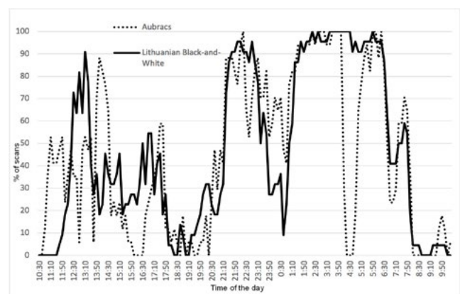
Fig 1: Lying behaviour of the Lithuanian Black-and-White and Aubrac bulls in the course of 24 hours.

time eating than the Lithuanian black and white bulls. Despite the fact that there were no significant differences in lying behaviour frequencies, Lithuanian black-and white bulls spent more time lying with less lying bouts compared with the Aubrac bulls (Table 2). The bulls of the Aubrac breed were distinguishable by more frequently expressed aggressive behaviour in the group. The mean time per animal spent in aggressive