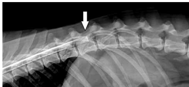
Figure 1. Cisternal myelogram of the thoracolumbar region of the spine indicating a complete obstruction (arrow) of the contrast medium at the caudal end of T12 vertebra in lateral view.

A 2-year-old, client-owned, male, intact, mixed-breed dog, was presented with a history of acute paraplegia evolving within hours. According to case anamnesis the animal developed an acute, weight-bearing lameness of the left posterior limb 15 days prior to presentation that subsequently evolved to paraparesis and paraplegia within hours. The dog had been treated symptomatically with non-steroidal anti-inflammatory drugs (NSAID) without any noted improvement. Physical examination was unremarkable. The dog was paraplegic with preservation of spinal reflexes and deep pain sensation. Neurological signs were compatible with a grade IV T3-L3 spinal cord lesion. Differential diagnosis included ischemic myelopathy, myelitis and acute spinal cord compression due to traumatic intervertebral disk rupture, spinal arachnoid pseudocyst or congenital vertebral anomalies. Myelography showed a marked stop of contrast medium above the caudal end of T12 vertebra, with an evident “golf-tee” sign, suggesting a focal intradural-extramedullary lesion (Figure 1, 2). The owner declined further investigation and elected euthanasia, as the prognosis for recovery was poor.