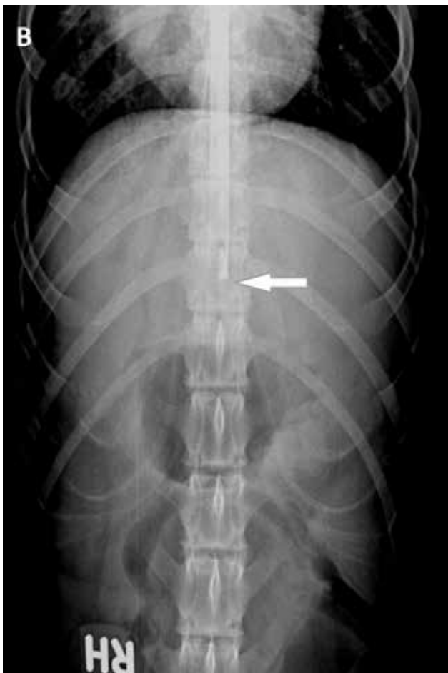
Figure 2. Cisternal myelogram of the thoracolumbar region of the spine indicating a “golf-tee” sign (arrow) in ventrolateral view (RH=right side).

lesion was mostly characterized by an epithelioid tubular pattern with delineated cystic and very cellular solid parts and very occasional glomeruloid features (Figure 5). Notably, there was a multifocal goblet cell differentiation and membrane specifications were seen throughout. The cysts varied in size, contained flocculent mucoid material and exfoliated cells. Between the surface structures, there were polymorphic spindleoid cells with some cellular exfoliation, high degree of basophilia, anisocytosis and anisokaryosis, round to elongated nuclei, highly hyperchromatic coarse chromatin and some areas with parachromatic vacuolation. Most of the cells contained 1-3 prominent paracentral and moderately anisometric nucleoli. Furthermore, there were small epithelioid nests scattered in between the tubular structures consisting of oval cells with an eosinophilic indistinct cytoplasm and hypochromatic round to oval nuclei and small central or paracentral nucleoli. The adjacent neuroparenchyma (spinal cord and nerve root) was deformed and presented with multiple enlarged myelin tubes, axonal spheroids and multiple gitter cells.