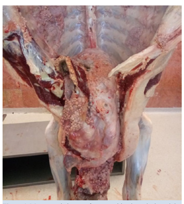
Figure 1. Macroscopic image of organs with tuberculosis nodules

positive signal İn three weeks ago after planting in BACTEC MGIT 960 fluid medium. Macroscopic image samples of organ are given in Figure 1. The study was also conducted to research whether M. bovis SIT 482 BOV isolated from cattle in Aksaray province was BCG strain or another strain giving the same pattern.