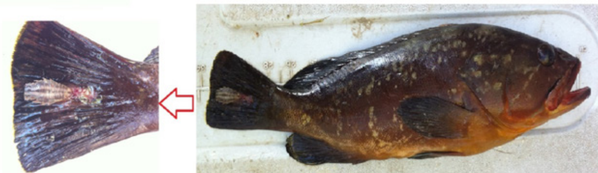
Figure 2. Nerocila bivittata on the caudal fin of Ephinephelus marginatus and hemorrhagic lesion.