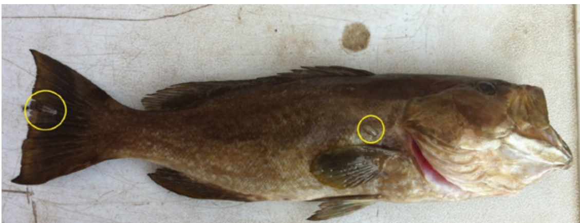
Figure 3. Nerocila bivittata on caudal fin and body surface of Mycteroperca rubra .