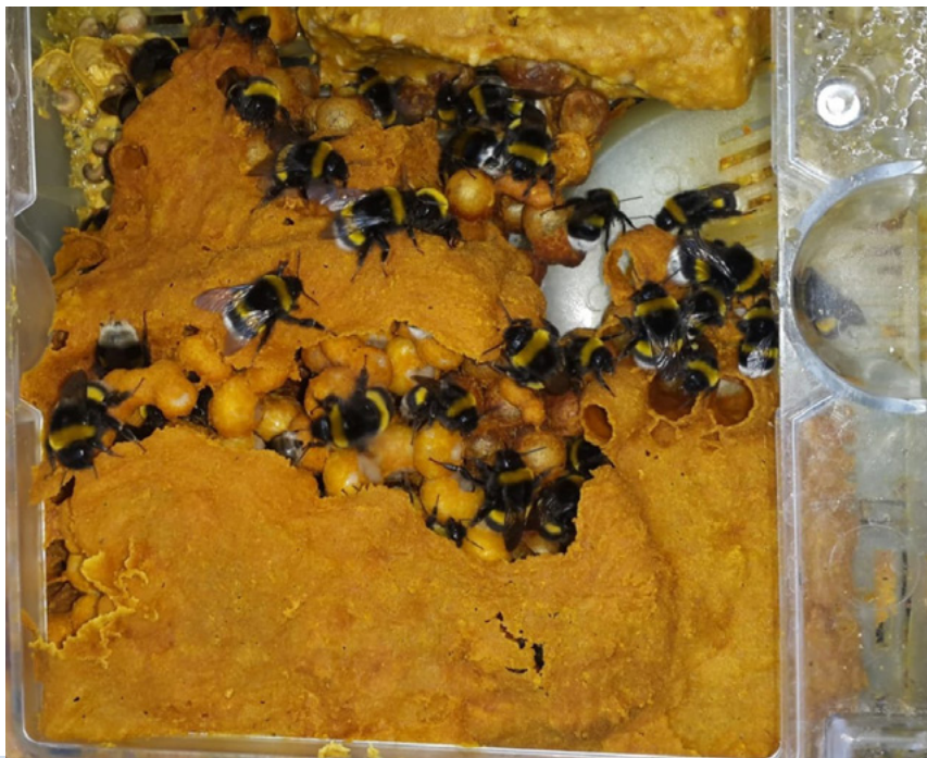
Figure 1. Bumblebee nest box