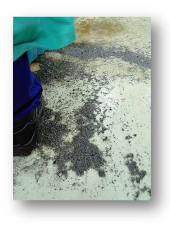
Figure 2: Sand removal from the lumen of the colon.