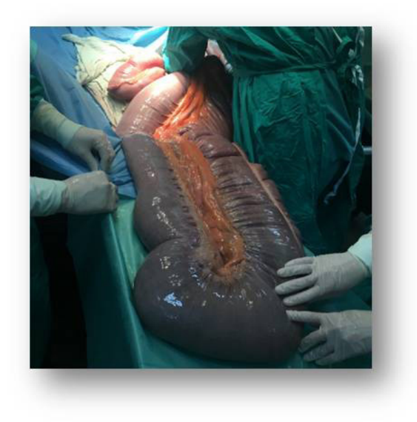
Figure 1: Sand colic surgery. Pelvic flexure enterotomy was performed.