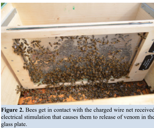
Figure 2. Bees get in contact with the charged wire net received electrical stimulation that causes them to release of venom in the glass plate.