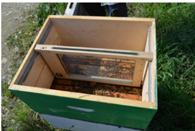
Figure 1. The bee venom collection device was placed inside the hive on a second empty floor.