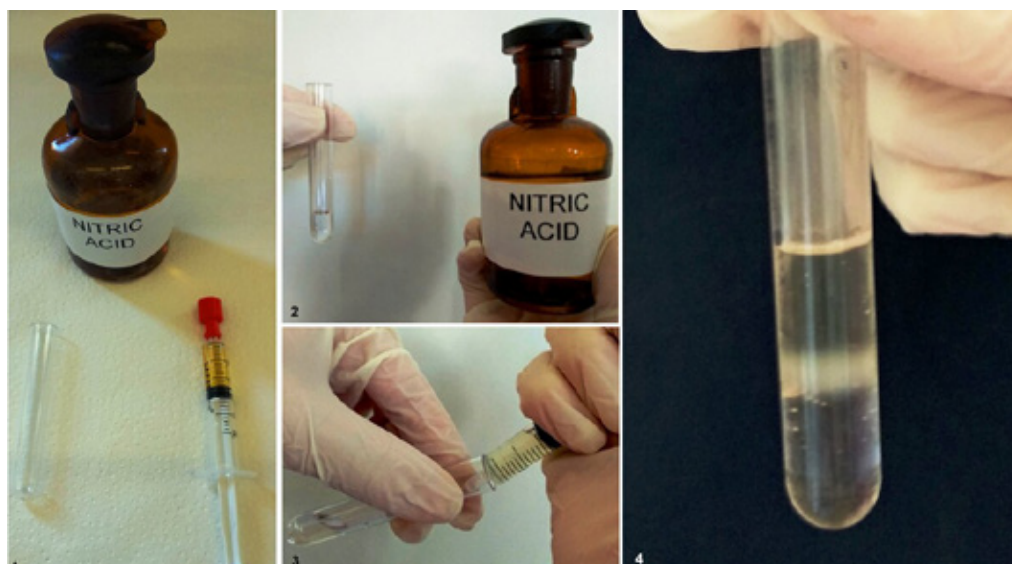
Figures 1-4. Procedure of Heller's reaction test.

Due to the nature of the variable Heller (discrete measurements), the non-parametric Spearman's correlation coefficient was used in order to study the correlation between UPC and Heller concentrations. In order to assess a better correlation between the two methods, the dogs were subdivided in two groups based on urine specific gravity (USG), the first group of dogs with USG > 1010 and the second group with USG \leq 1010 . Since 1010 was the mean value of isosthenuria, it was set as the cut-off value.