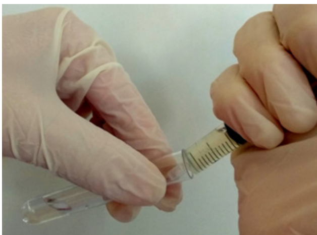
Figure 3. Add equal amount of urine in the tube by layering the urine sample above the nitric acid, caution should be given in order not to mix the samples.