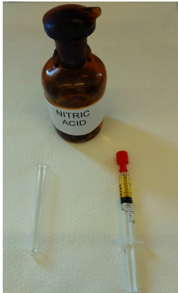
Figure 1. Materials needed for Heller's reaction test (tube, nitric acid, urine sample).

closely correlated to the 24-hour urine protein quantification (Le Vine et al., 2010; Adams et al., 1992; Monroe et al., 1989).