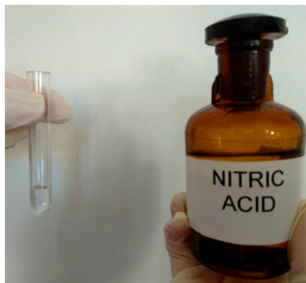
Figure 2. Put a small amount of nitric acid (approximately 1ml) in the tube.