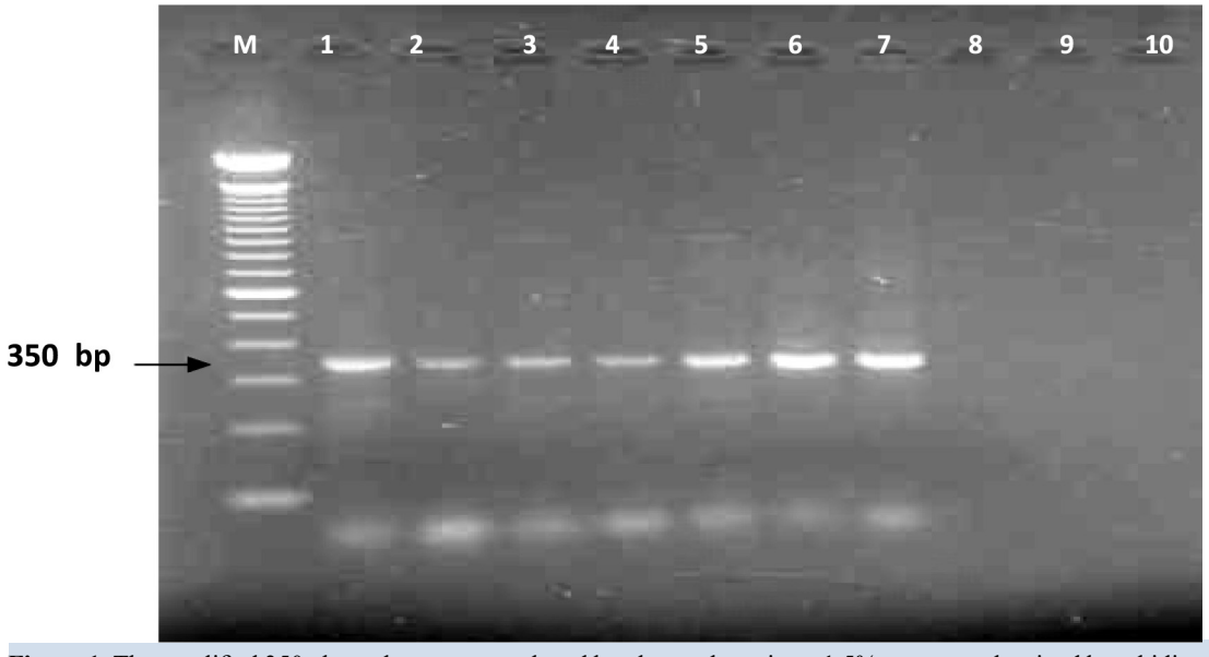
Figure 1. The amplified 350 pb products were analyzed by electrophoresis on 1.5% agarose gel stained by ethidium bromide. Lane M , 100 bp molecular weight marker; lane 1 , Goat Blood; lane 2 , Sheep Blood; lane 3 , Goat Nasal swab; lane 4 , Sheep nasal swab; lane 5 , Goat liver tissue; lane 6 , Goat Lymph tissue; lane 7 , Goat lung tissue; lane 8 , Sheep Lymph tissue; lane 9 , Sheep liver tissue; lane 10 , negative control

The author declares no conflict of interests.