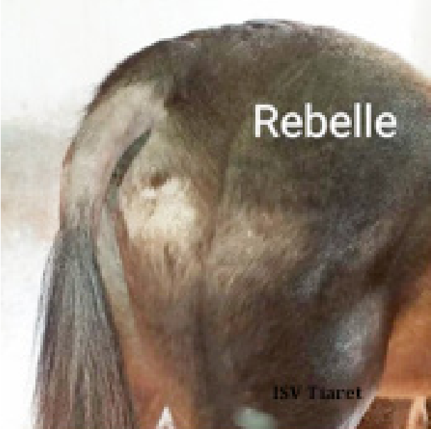
Figure 5: Rat tail.