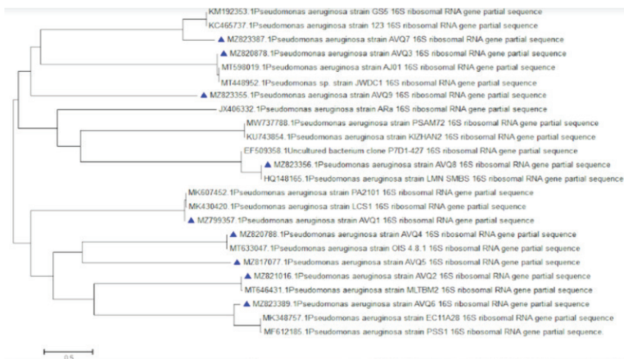
Fig. 2. Phylogenetic tree analysis based on the 16S rRNA gene partial sequence that used for nine isolates of Pseudomonas aeruginosa