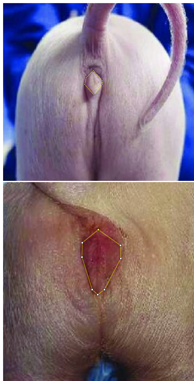
Figure 1. Measurement and calculation of vulva size.

Ovaries were extirpated and fixed promptly in 10% buffered formalin upon weighing, as well as the liver tissue. After routine processing, the tissues were embedded in paraffin. Graded alcohol was used for the dehydration of the tissue samples, following the