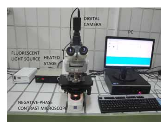
Fig. 1. Equipment for Computer Assisted Sperm Analysis.