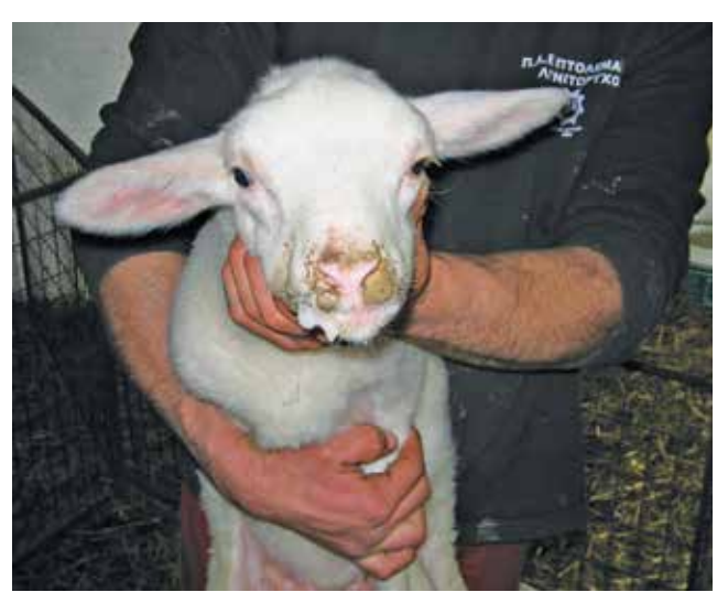
Figure 2. Orf lesions and nasal discharge due to bronchopneumonia.