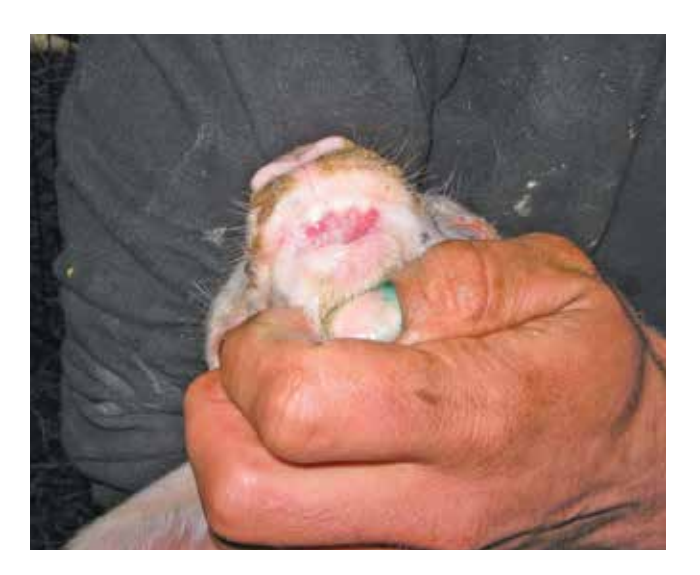
Figure 1. Lamb with stomatiis.

Bacteriological cultures were performed using blood agar plates and mycoplasma broth and plates inoculated with lung tissue samples. Bacteria were isolated and identified using routine methods (Quinn et al., 2002). Susceptibility test was applied according to Kirby-Bauer disc diffusion method (Quinn et al., 2002; VET01S, 2015). The samples were examined for