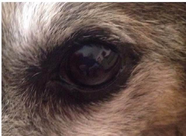
Fig 6: Left eye, 3 months after surgical removal of the mass. The lower eyelid appears normal, without any anatomical deformities.

Fine needle aspiration samples that were taken during the surgical procedure proved to be inconclusive caused by suboptimal preparation and bloody smears. The histopathological appearance of the examined samples revealed the presence of sheets of undifferentiated basal cells with rare sebaceous differentiation. Focally, scat-