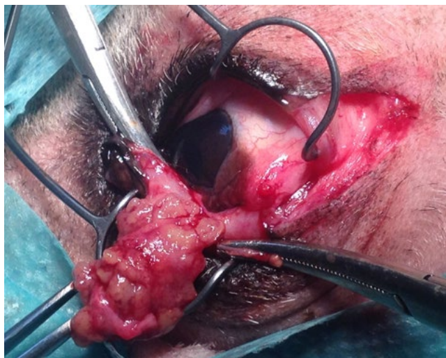
Fig 3: Surgical removal of the mass of the left eye. After incision on the palpebral conjunctiva of the lower eyelid of the left eye, the mass was easily separated from the surrounding tissues and completely excised.

bral conjunctiva of the left lower eyelid was scheduled. The decision to perform the second surgery one month later was based on the age of the dog, the duration and severity of the first surgery, and the time required for the histopathological results of the mass. The dog was anesthetized using acepromazine (0.05mg/kg b.w., intramuscularly, Acepromazine Maleate, VEDCO) and butorfanol (0.1mg/kg b.w., intramuscularly, Butomidor, Richerpharma) for premedication, propofol for the induction and isoflurane for maintenance of anesthesia and meloxicame was given as well (at the doses mentioned before). After incision on the palpebral