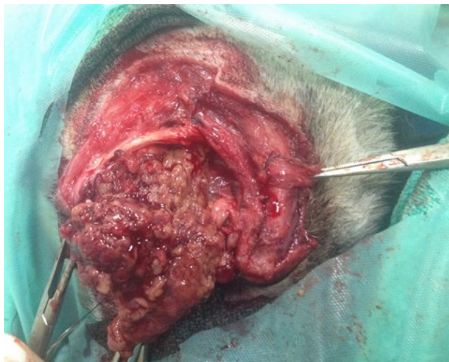
Fig 2: Excision of the globe and periorbital tissues, with extended removal of the tumor of the right eye.

bral conjunctiva of the left lower eyelid was scheduled. The decision to perform the second surgery one month later was based on the age of the dog, the duration and severity of the first surgery, and the time required for the histopathological results of the mass. The dog was anesthetized using acepromazine (0.05mg/kg b.w., intramuscularly, Acepromazine Maleate, VEDCO) and butorfanol (0.1mg/kg b.w., intramuscularly, Butomidor, Richerpharma) for premedication, propofol for the induction and isoflurane for maintenance of anesthesia and meloxicame was given as well (at the doses mentioned before). After incision on the palpebral