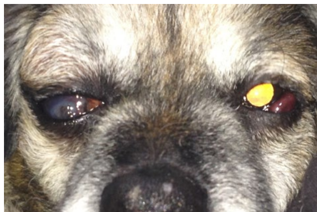
Fig 1: A dog with periorbital swelling and strabismus of the right eye, and oedema of the lower eyelid of the left eye.

Neoplasia of both eyelids was strongly suspected and, for definite diagnosis, a series of diagnostic tests were