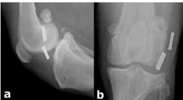
Figure 3. Mediolateral (a) and caudocranial (b) radiographic views of the left stifle taken 2 years after extracapsular stabilization. There is mild increased new bone formation, most notably on the intercondyloid eminence and the lateral gastrocnemius sesamoid bone. Small osseous opacities are superimposed medially and caudally on the joint. The lucent area visible in the tibial tuberosity seen on the lateral view represents a hole drilled to pass the suture material in connection with the extracapsular stabilization procedure. Crimps are noted on the lateral aspect of the stifle. Moderate joint effusion is still visible, mildly less than preoperatively. Mild thickening of the patellar ligament is also visible