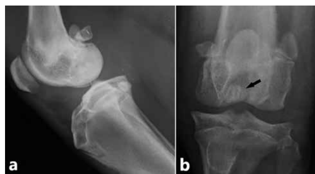
Figure 1. Mediolateral (a) and caudocranial (b) radiographs of the left stifle one month after both CLs rupture. Moderate joint effusion with reduced visibility of the infrapatellar fat pad. The popliteal sesamoid appears caudodistally displaced. At least three bone opacities are visible superimposed on the lateral surface of the medial femoral condyle (arrow) that likely reflect the multiple fragments of an avulsion fracture at the origin of the caudal cruciate ligament in the intercondylar fossa identified surgically. Slight new bone formation is visible on the patellar apex and on the distal aspect of the medial gastrocnemius sesamoid bone is also visible+

Two months after surgery the lameness of the operated limb was very mild, while after 8 months the gait seemed to be normal on observation. Pain and crepitus were not clinically identified in the stifle. Osteoarthritic lesions were mainly restricted on the intercondyloid eminence and the lateral fabella. Two years postoperatively, the clinical view of the dog was unchanged, while signs of mildly worsened left stifle osteoarthritis were identified radiographically (Figure 3).