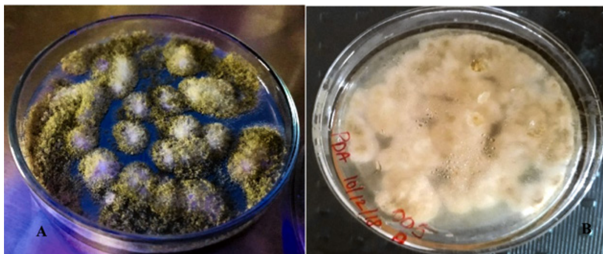
Figure 1. (A) Shows aflatoxigenic nature under UV light at 365 nm, (B) Ammonia vapor

The HPLC analysis of selected samples confirmed the presence of aflatoxins and the aflatoxins B1 and B2 in the samples were quantified as 35.94 \mu\text{g} and 2.53 \mu\text{g} respectively (Figure 2).