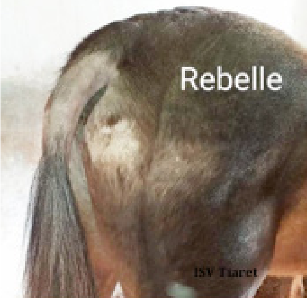
Figure 5: Rat tail.