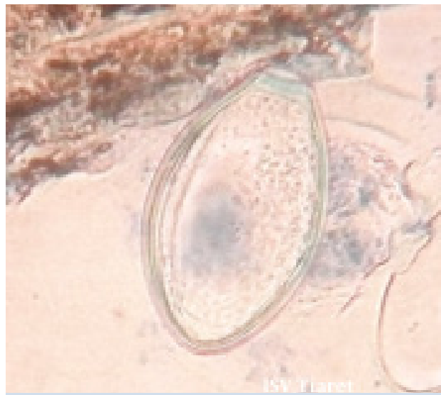
Figure 1: Oxyuris equi eggs at morula stage (without coloration) (G.X40).

This method is simple, fast and inexpensive (Gevrey, 1971). A transparent adhesive tape was applied to the skin of the perianal region, then removed and examined microscopically to identify the characteristic oxyurid eggs (Thienpont et al., 1979) (Fig. 1 and 2).