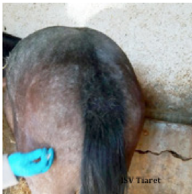
Figure 3: Tail rubbing.

Results shown in table 5 revealed that the more observed sign was tail rubbing (Fig. 3) with a prevalence of 42.41% followed by scratching (31.65%) and the presence of grey-yellowish egg masses on the perianal skin (20.89%) while the presence of injuries on the perineal region (Fig. 4) was only recorded in 5.06% of infected animals. Our results revealed that 86.76% of infected horses presented more than one sign (47.06% presented two signs, 33.82% three signs and 5.88% four signs). Beugnet et al. (2005) reported that severe itching of the perineal skin was the more common clinical sign. The infected animal rubs very frequently against any object in its environment causing consequently the break off hairs and giving the tail a rat tail appearance (Fig. 5).