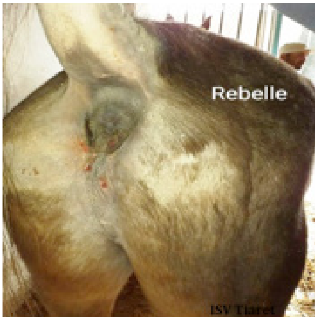
Figure 4: Injuries and lesions on the perianal skin