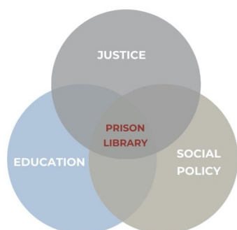
Figure 3. Prison Library and State Policies

The contribution of the prison library to the wider set of policies exercised by the state -justice, education, society- is central, and has a pivotal role in the development of knowledge, attitudes, skills and more widely the information literacy of detainees (Figure 3). It is essential that, in Greece, modern policies with substantial state provision be developed on this issue, taking advantage of new technological developments and informational needs.