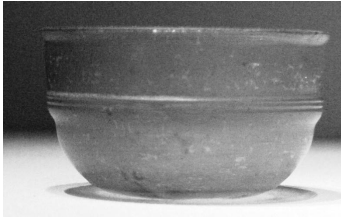
Fig. 1. Green Roman glass cup unearthed at Eastern Han Dynasty (25-220 AD) tomb, Guangxi, China.