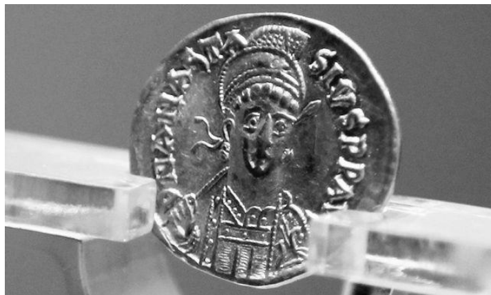
Fig. 2. A Solidus of Anastasius I (491-518), in 2013, found in a tomb at the period of North Wei (386-534 AD), Luoyang, China.

http://cn.blouinartinfo.com/news/story/977255/luo-yang-fa-xian-bai-zhan-ting-jin-bi , accessed to 16-11-2015.