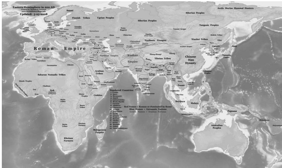
Fig. 3. The Parthian Empire on the map in 200 AD

https://commons.wikimedia.org/wiki/File%3AEast-Hem_200ad.jpg , accessed to 16-11-2015.