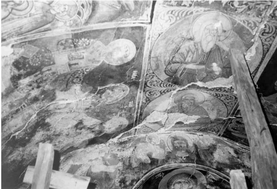
5. The Three-Faced Christ and The Crowning of the Holy Virgin. The chapel of SS. Cosmas and Damian (1750), Vithkuqi.