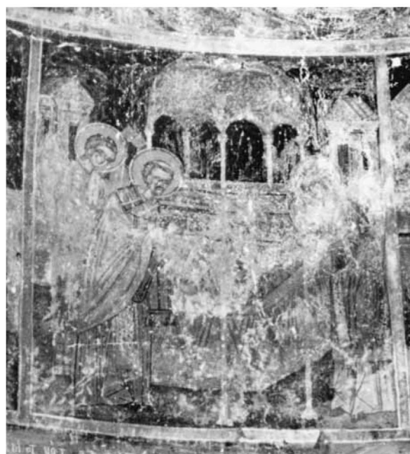
2. The Liturgy of St. John Chrysostom. The church of Archangels Michael and Gabriel (1720 - 1725), Moschopolis.