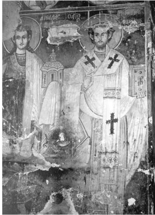
16. St. Aitalas and St. Gregory Dialogos. The church of SS. Peter and Paul (1764).