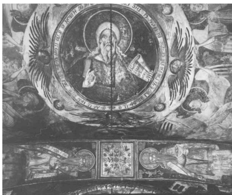
8. The God Sabbaoth. The church of St. Athanasios (1745), Moschopolis.