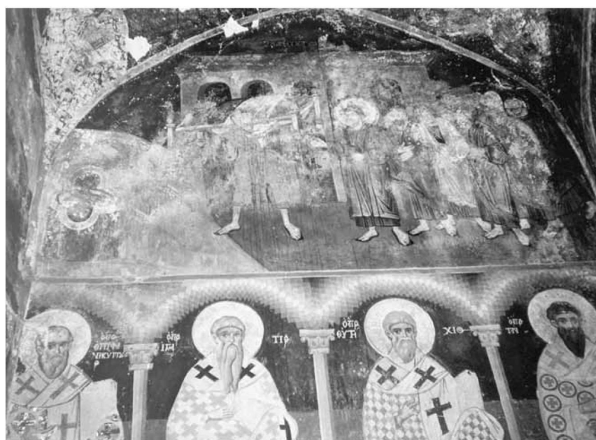
15. Saints and the Healing of the Paralytic. The church of St. Nicholas (1726), Moschopolis.