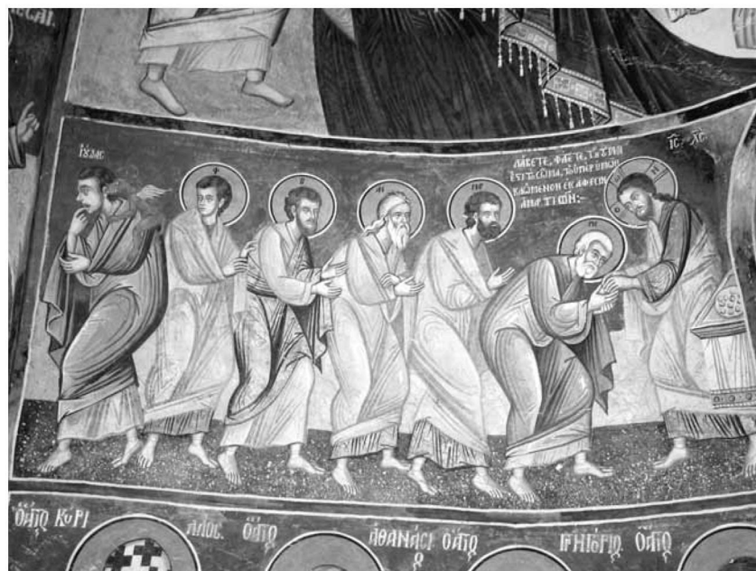
6. The Communion of Apostles. The church of SS. Peter and Paul (1764), Vithkuqi.