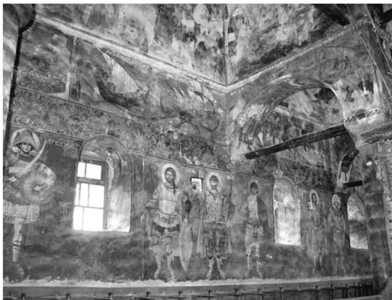
14. Saints and Scenes from St. Nicholas Vita. The church of St. Nicholas (1726), Moschopolis.