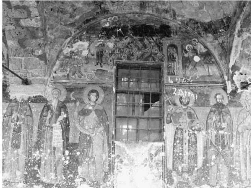
18. Saints and Apocalypses. The church of St. Nicholas (1750), Moschopolis.