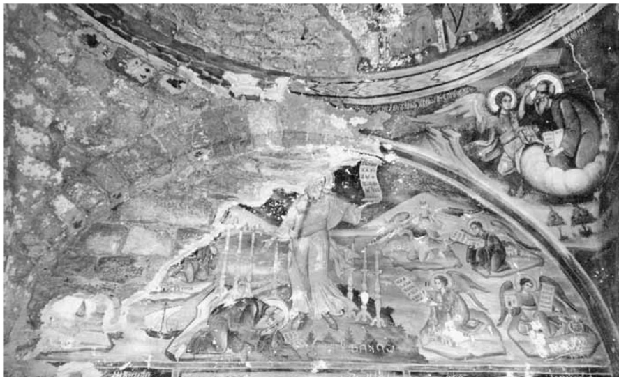
17. Apocalypses (1:12-18). The church of St. Nicholas (1750), Moschopolis.