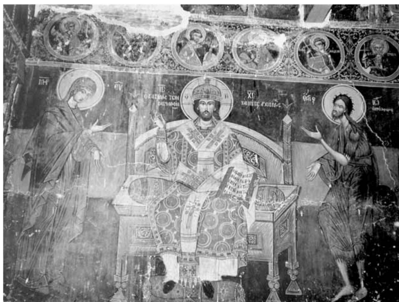
11. King's Deesis . The church of Archangels Michael and Gabriel (1682-1728), Vithkuqi.