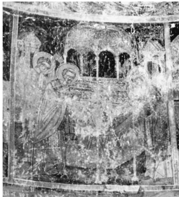
2. The Liturgy of St. John Chrysostom. The church of Archangels Michael and Gabriel (1720 - 1725), Moschopolis.