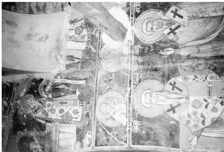
4. The Divine Liturgy. The church of St. George (1767), Vithkuqi.