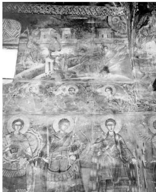
13. Saints. The church of Archangels Michael and Gabriel (1720-1725), Moschopolis.