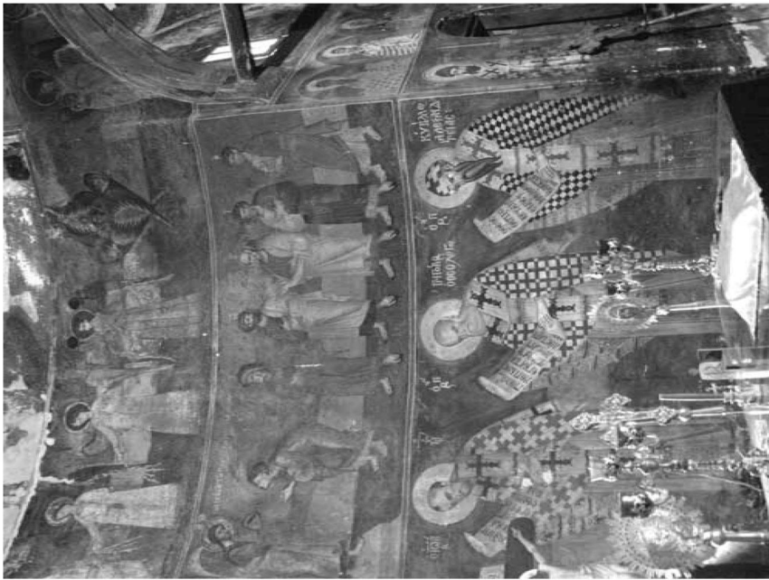
3. The Apse. The church of St. Nicholas (1726), Moschopolis.