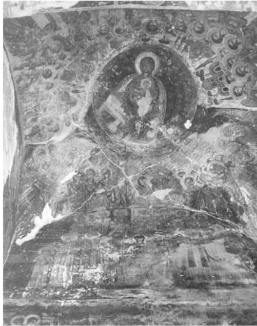
10. In Thee Rejoiceth and The Orthodox Sunday. The church of Dormition of Holy Virgin (1712), Moschopolis.