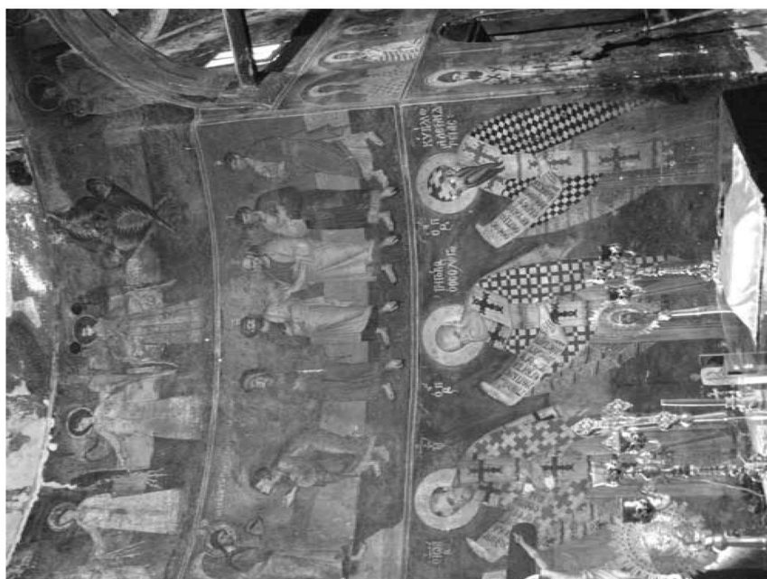
3. The Apse. The church of St. Nicholas (1726), Moschopolis.