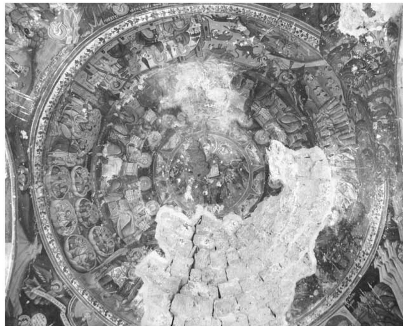
19. The Last Judgement. The church of SS. Peter and Paul (1764).