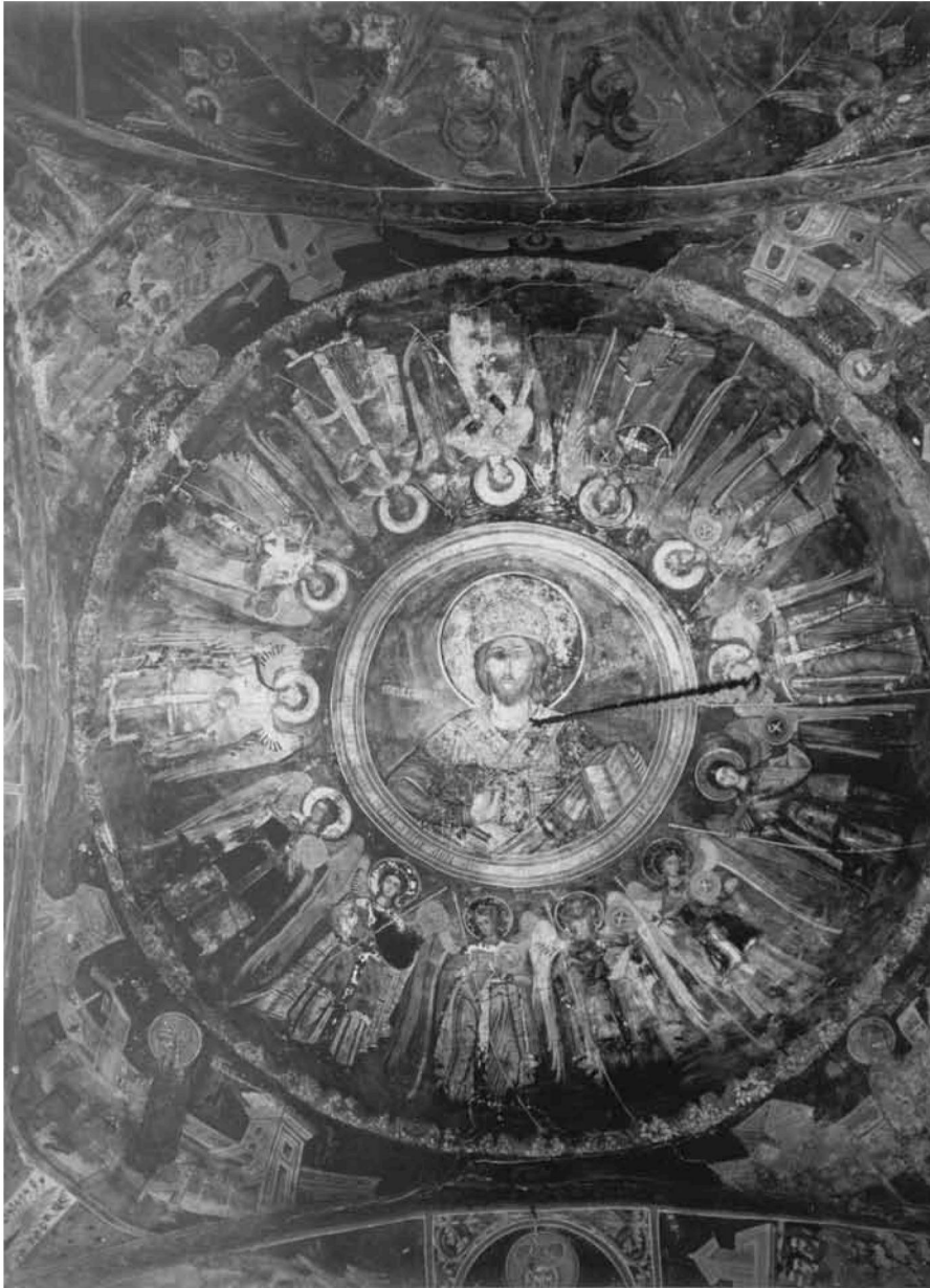
9. Christ King of Kings and High Priest. The church of Archangels Michael and Gabriel (1720-1725), Moschopolis.