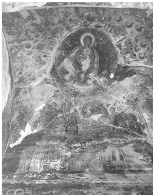
10. In Thee Rejoiceth and The Orthodox Sunday . The church of Dormition of Holy Virgin (1712), Moschopolis.