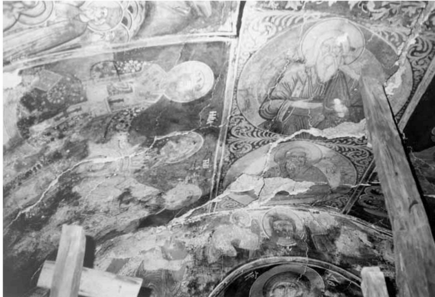
5. The Three-Faced Christ and The Crowning of the Holy Virgin. The chapel of SS. Cosmas and Damian (1750), Vithkuqi.