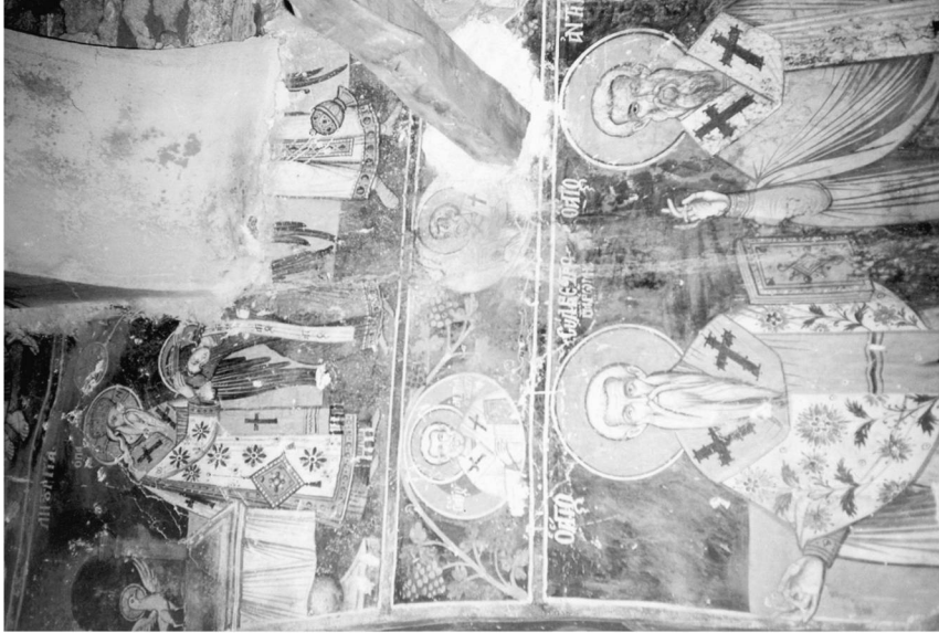
4. The Divine Liturgy. The church of St. George (1767), Vithkuqi.