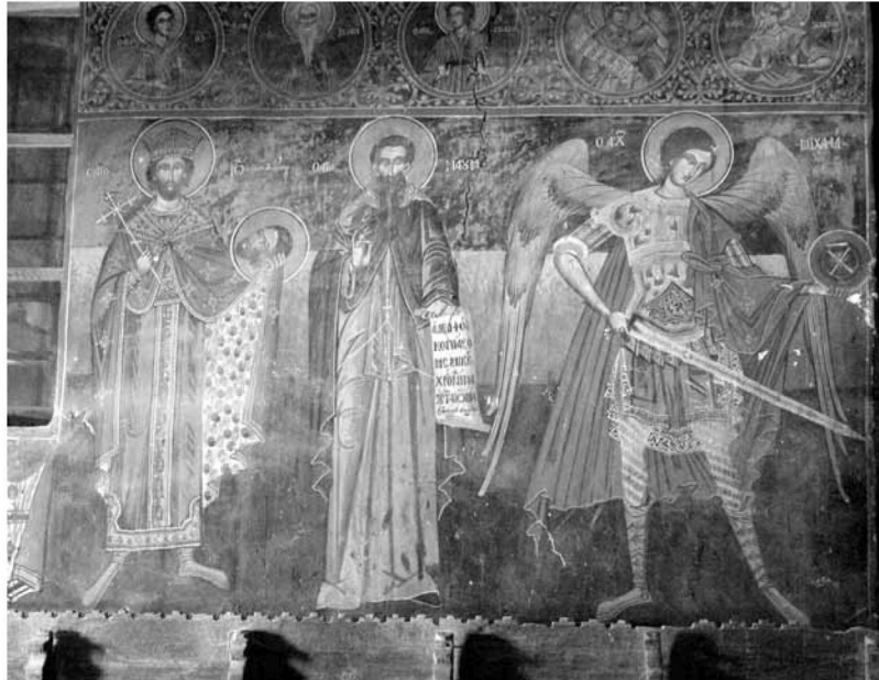
12. St. John Vladimir, St. Nahum and Archangels Michael. The church of Archangels Michael and Gabriel (1682-1728), Vithkuqi.