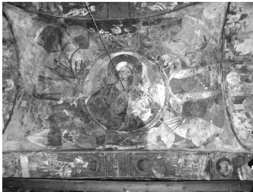
7. The God Sabbaoth. The church of St. Nicholas (1726), Moschopolis.