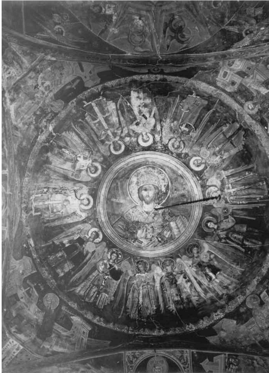
9. Christ King of Kings and High Priest. The church of Archangels Michael and Gabriel (1720-1725), Moschopolis.