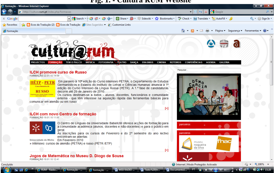
Fig. 1. - Cultura RUM Website

For students, it represents an extension of knowledge and an interactive room outside the traditional classrooms, approaching Lévy's concept (1997) on "Cyberculture", or even, on the virtualization process society faces nowadays, in which the virtual is not opposed to reality, but it complements it (Lévy, 2010). Classrooms today are no longer the only standard teaching, still less the exclusive learning area. Geographical boundaries are diluted; the world today is interconnected by the simultaneity of the new information and communication technologies. Thus, it is necessary to understand the contemporary changes at a social, political and economic level and the way they affect human relations in all society spheres.