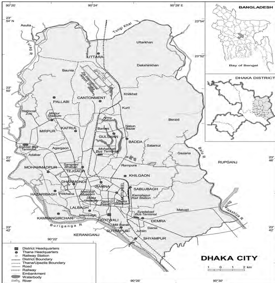
Map 1: Dhaka City

At the recent decade, Dhaka has emerged as one of the fastest growing megacities. It had a manageable population of 2.2 million in 1975 and that became 12.3 million in 2000. The growth rate of this urbanizing population during 1974-2000 was 6.9% (UN, 1998). There are very few other cities in the world, which has ever the experiences of having such a high growth rate in population during this period. Apparently the growth rate of urbanizing people in Dhaka City will also continue to remain high even in the coming years. At 2000-2015 the expected growth rate is 3.6% and will reach a total population of 21.1 million in 2015 (UN, 1999).