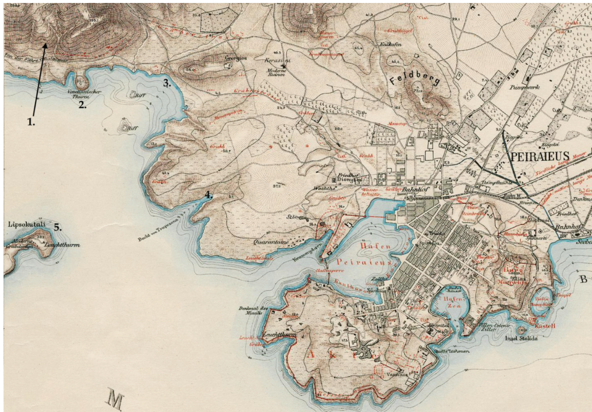
Map I: Karten von Attika Bl. III. (1) foothills of Mt. Aigaleo; (2) the 'Venetianischer Thurm'; (3) Keratsini; (4) Trapezona; (5) Leipsokoutala, ancient Psyttaleia. Modern Perama lies beyond the boundaries of this map, extending to the left of (1) and (2).

The exact location now lies under the heavy industrial development of this stretch of coastline, but a good candidate for Dodwell's Κλεφθο-πυργος ( sic. ) is marked on Curtius' and Kaupert's Karten von Attika as the 'Venetianischer Thurm' ('Venetian Tower', Karten von Attika Bl. III). Another nineteenth-century traveller, W. M. Leake, wrote that the eastern entrance to the strait of Salamis was demarcated by the western cape of Port Phōrōn on the mainland and the cape of Agia Varvara on Salamis (the easternmost extremity of the island, close to Psyttaleia). 13 Leake placed Phōrōn Limēn at Keratsini, the bay to the east of this tower, and not at the bay of Trapezona (mod. Drapetsona), which he thought was too close to Piraeus. 14 Curtius and Kaupert were inclined to agree with him. 15