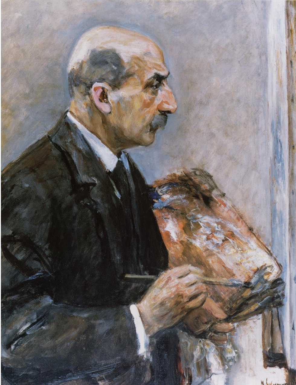
Figure 5: Max Liebermann: Self-Portrait with Palette at the Easel, in Profile Towards Right , 1915, oil on cardboard, 80x65 cm, in private possession.

The depiction of the painter in profile seems to suspend the play of perspective and sight axes which are so prominent in Velázquez's painting, seeming to take the viewers and their involvement out of the game. Instead, the prominent palette directs attention to colour – or rather, to relationships of colour, as we will see.