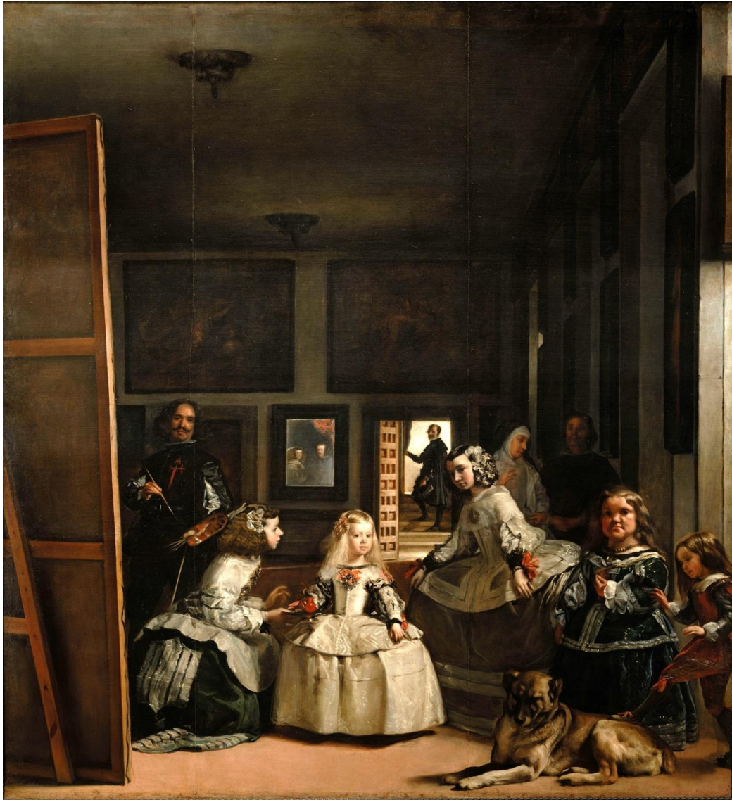
Figure 1: Diego Velázquez: Las Meninas . 1656, oil on canvas, 312x281 cm, Madrid: Museo del Prado.

The painting shows –among many other things (cf. Greub)– a scene of painting. It is not primarily the figure of the painter towards which the painting guides the viewers' eyes, but the artist's canvas, the outer edge of which cuts a highlighted line through the picture's dark space. In other words, the artistic 'material' is prominently present in the painting (not only the canvas, but also the paint and the brushes, as we will soon see). However, what remains absent is the ominous 'white canvas' mentioned previously: It is the (darkish) rear of the canvas, its wooden framework, that the viewers get to see – the front, the artist's painting-in-the-making (is it still white and more or less untouched?) is hidden from our view. This hidden front, the mystery of what is being made, constitutes this singular painting's enigma. That is why I think Las Meninas illustrates the question that we encountered when thinking about the scene of inscription and its constitution of the artwork as a form engendered by an artist-subject. As Michel Foucault and many others have shown, the beauty of Velázquez' painting lies in the