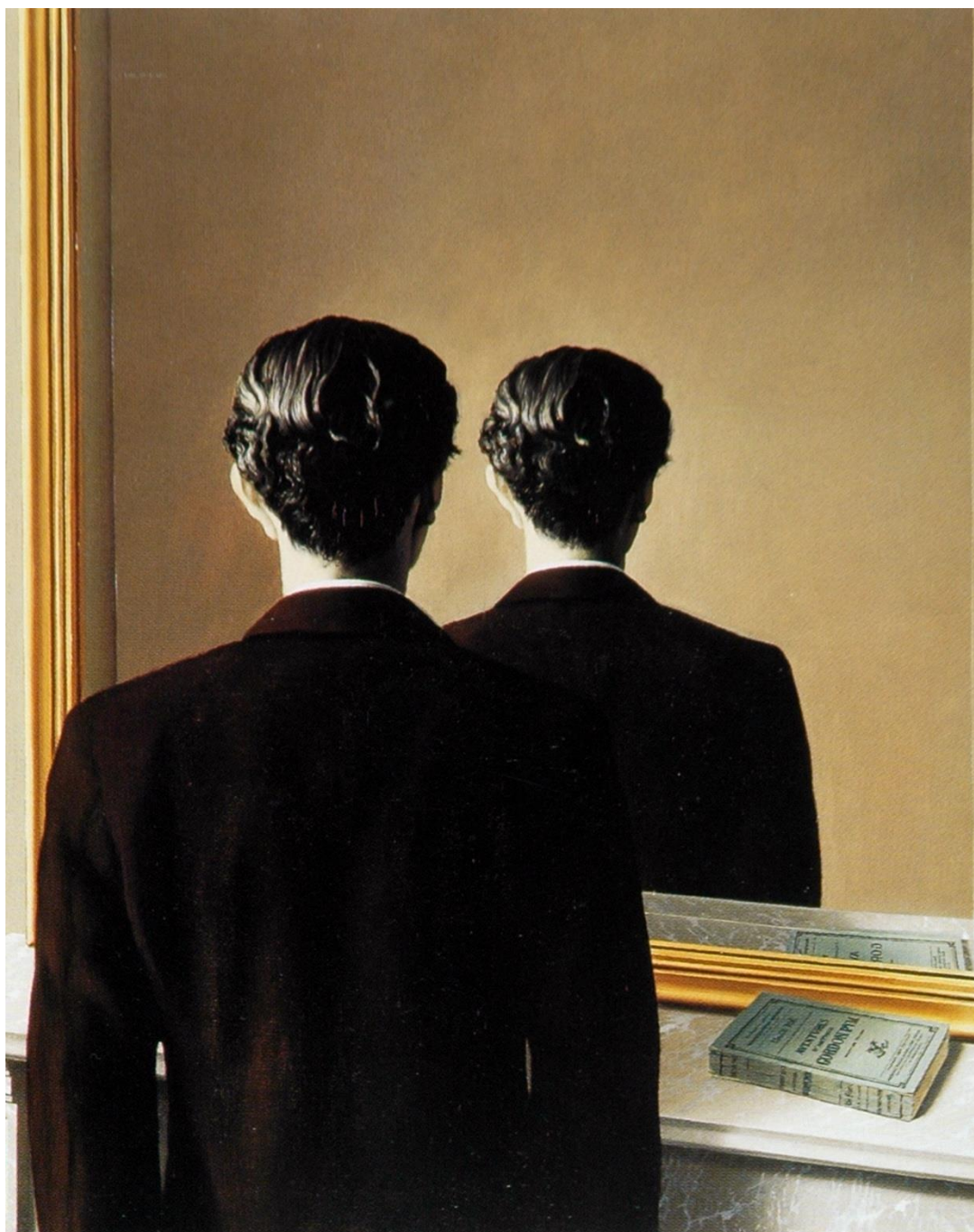
Figure 3: Rene Magritte: Not to Be Reproduced . Oil on canvas, 81x65cm, Rotterdam: Museum Boijmans van Beuningen.

Las Meninas is not as extreme a case as it is Rembrandt's drawing. It only hints at the tension of different perspectives integrated in one painting but prevents an escalation by not depicting the artist's model. The mirror on the wall appears to solve the riddle of the hidden canvas, but in fact poses another question: Whose position is it that we, as viewers, have taken over? Almost all eyes seem to be on us – but the position does not feel regal. We do not see ourselves in the mirror, which is not prevented by the fact that the mirror shows a couple that it is hard to identify with, as every viewer is a single viewer. As we will see in a minute, the mirror is wide of the eyepoint constructed by the painting's central perspective.