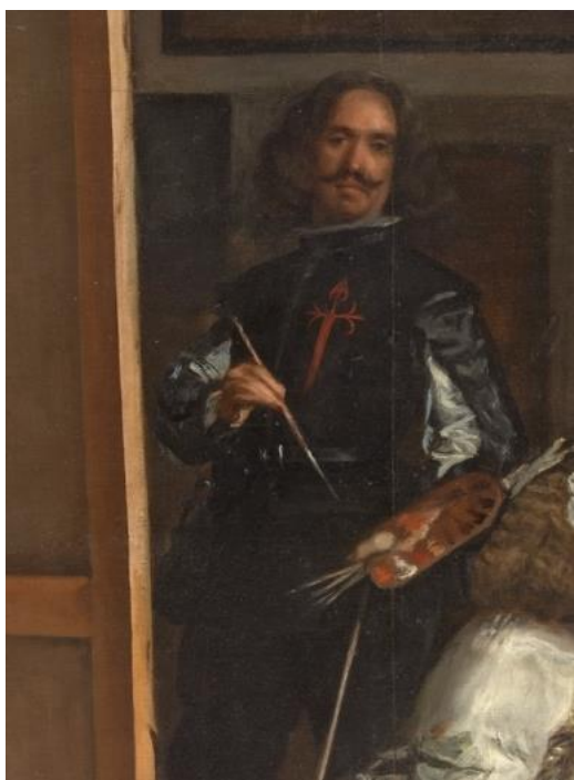
Figure 4: Detail from: Velázquez, Las Meninas .