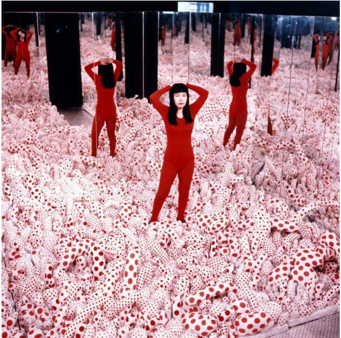
Figure 1: Yayoi Kusama standing inside Infinity Mirror Room – Phalli's Field , sewn stuffed cotton fabric, board, and mirrors, 455 × 455 × 250 cm, "Floor Show", Richard Castellane Gallery, New York, 1965 © Yayoi Kusama.