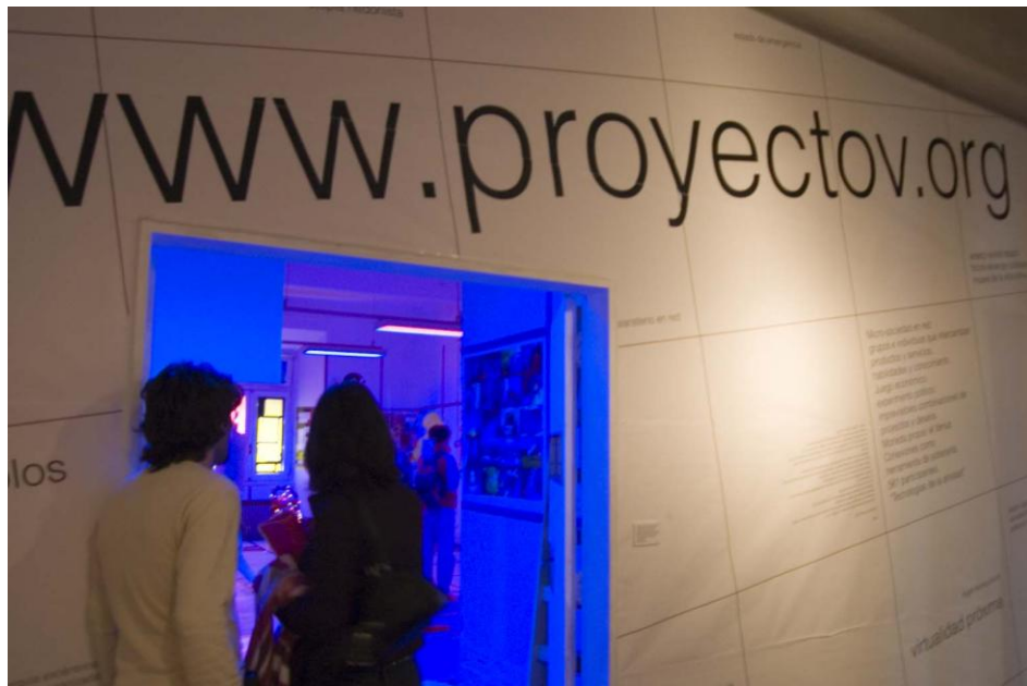
Proyecto Venus at Estudio Abierto (2006). Correo Central, Buenos Aires.