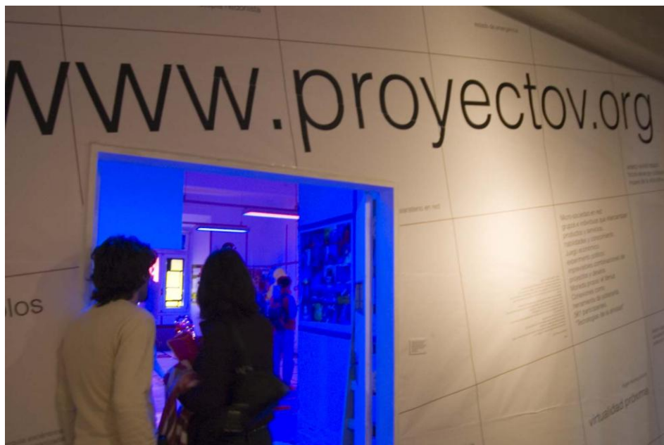
Proyecto Venus at Estudio Abierto (2006). Correo Central, Buenos Aires.