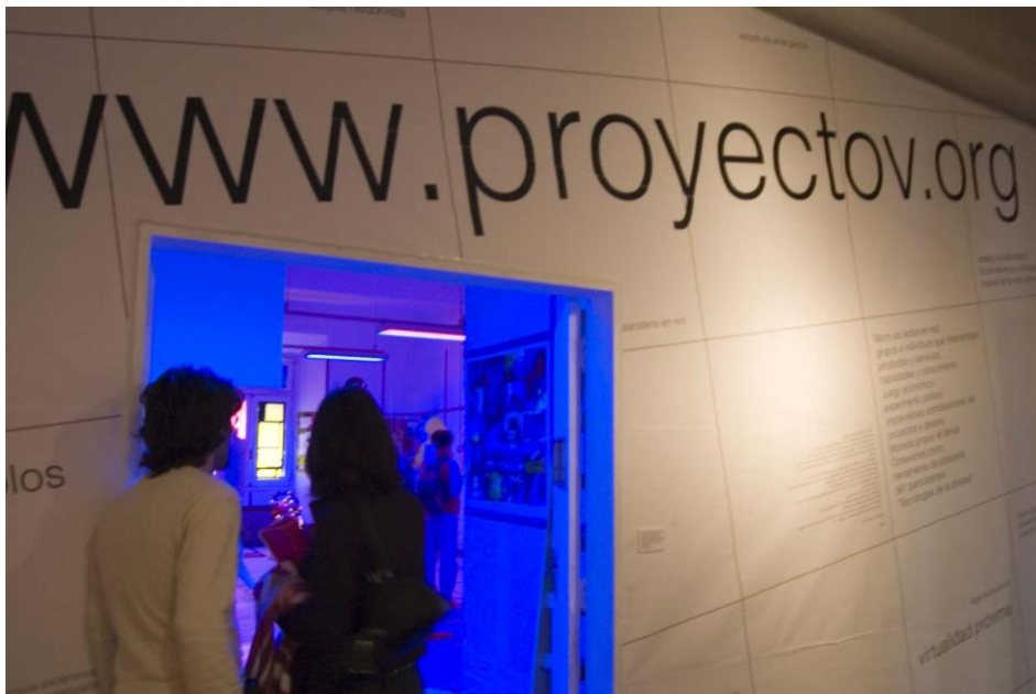
Proyecto Venus at Estudio Abierto (2006). Correo Central, Buenos Aires.