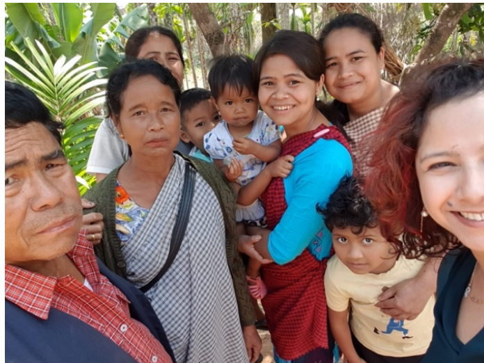
Figure 12: My interlocutors in Nongmyndo. March 2020

Lastly, I acknowledge the invaluable help, assistance, and hospitality of village members wherever I went for fieldwork. This documentation and interpretation would not be possible without the constant support and cooperation of my sangkhini friends.