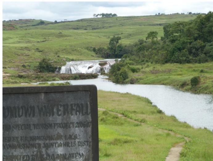
Figure 11: The Thlumuvi waterfall is where the progenitress, (named Lih Dakha) of the Chiefs of Sutnga emerged from. She was said to be a "fish woman."

relational and reciprocal relationships between all species of sentient beings that exist together. This mutuality, however, is not peaceful, beautiful, or harmonious. The Khasi do not live in a peaceful or harmonious relationship with their ecology: this relationship is punctuated with death, destruction, and bloody sacrifice. I pinpoint this aspect to highlight the fact that contrary to idealised views of the way that indigenous people exist in the world, Northeast Indian indigenous people's relationship with 'nature' is fraught with attempts at survival: people exist despite nature, not in harmony with it.