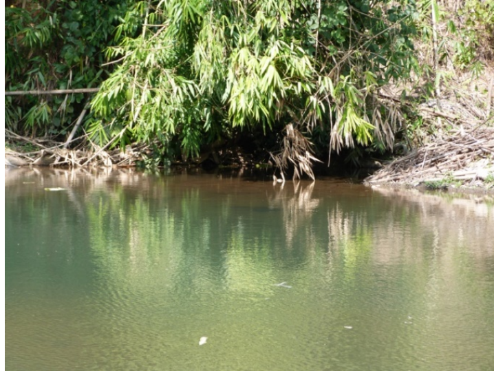
Figure 7: Thwei Thowsan is the sacred place of the Sangkhini on the Rdiak River.

opposite gender. So, the girl's rngiew became that of a man's so that the puri could marry him.