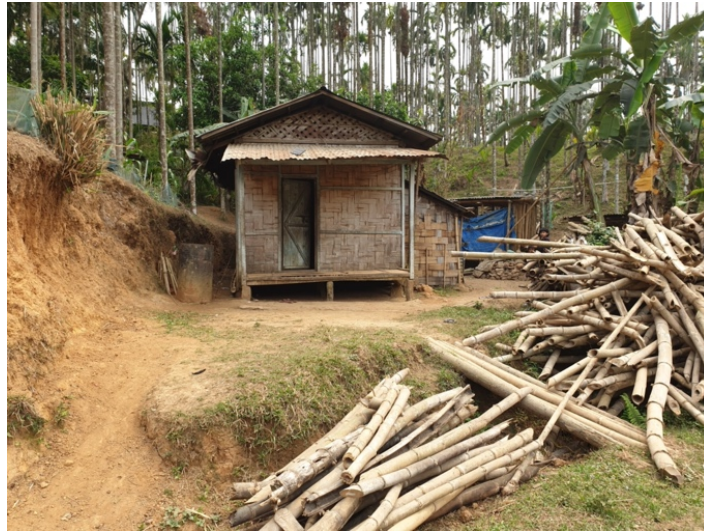
Figure 10: Harjit's home. Nongmyndo, 2020