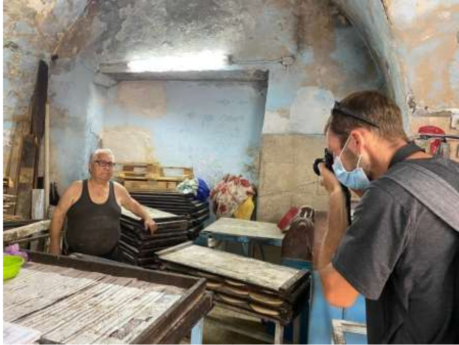
Figure 5: Visiting a traditional Bakery

He views authenticity, solidarity and cultural symbiosis as unique intangible components of the city 103 . According to him: "These components feed each other and are the basis for establishing social codes, fed to human beings from their early stages as embryos, in their homes and in their neighborhoods" (Matta, 2020). His activities in the city are led by his opinion that: "authenticity in Akko is strong enough to face virtual materialism that could cheaply run down the unique 'spirit of the place'." His dramatized tours and activities are double targeted: "On the one hand my need to earn a living and on the other hand my understanding that it is important to present the unique spirit of Akko in a way that it is faithful to my noble heritage and the collective memory of my own intangible culture." He believes that "only those who breathe and live this intangible heritage can express it and "translate" it faithfully and responsibly. This is because it has been that person's legacy for generations. Therefore authentic intangible heritage cannot just be an academic research. It must continue to breath and live as a real mechanism without discussions about its essence." He has declared over and over that he favors considerate tourism and he sees over-tourism predatory and destructive.