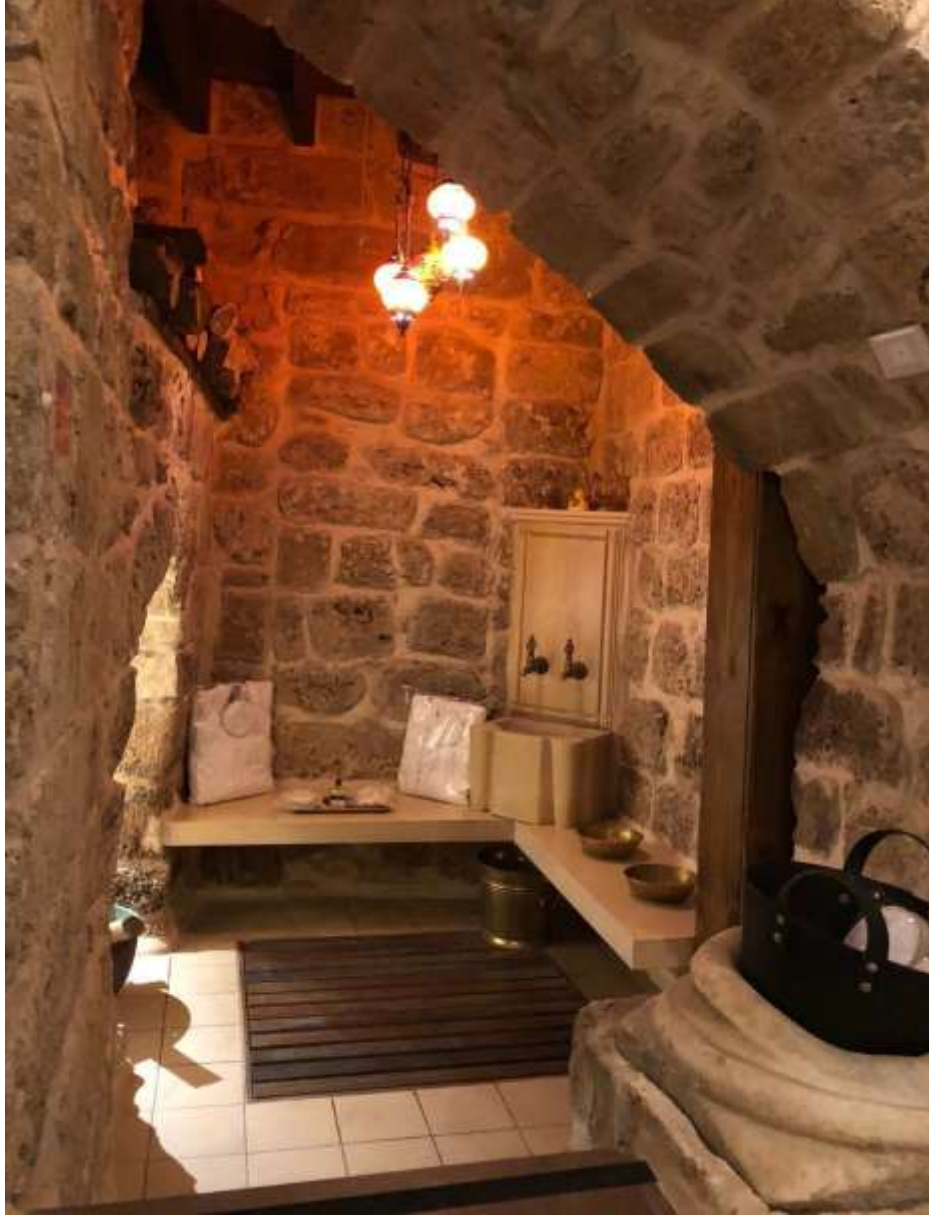
Figure 4: An Example of an Authentic Bed and Breakfast Tourist experience

The new touristic experiences themselves are based on unique intangible values such as traditional customs, food, costumes and music. They are representative of the local Muslim community. Sometimes these experiences are simple, embodied in gritty and slummy areas of the city. This combination enables an encounter with the glit-