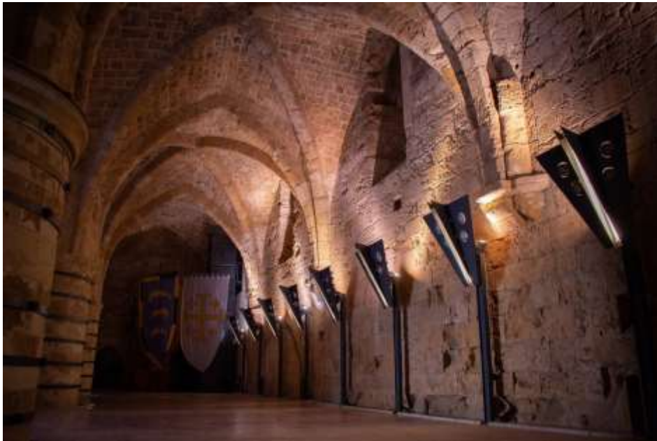
Figure 2 The Refectory in the Crusader Hospitaller Compound

The aesthetic, historical and scientific values of Akko were designated during preparations of the new Master Plan in 1993 and again during thenomination for World Heritage in 2001 (Killebrew, DiPietro, Peleg, Scham & Taylor 2017). The city's unique values are embodied in her shape, texture and size derive on the peninsula surrounded by the sea. The remains of the crusaders that were discovered in archaeological excavations uncovered the transition from the Romanesque architectural style to the Gothic architectural style. Narrow alleys, government buildings, public buildings, mosques, markets, bathhouses, workshops and commerce, wealthy and traditional homes from the Ottoman period give the city its eastern atmosphere and character. This city underwent massive conservation and development procedures that turned the city into an important touristic attraction in North Israel.