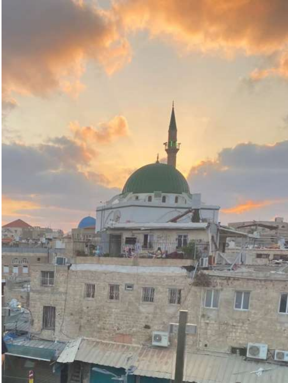
Figure 3 Ottoman Islamic features in Old Akko

It is estimated that about 1,500,000 – 2,000,000 international and Israeli tourists visit the city of Akko each year 102 . Only about 400,000 tourists buy tickets to visit the