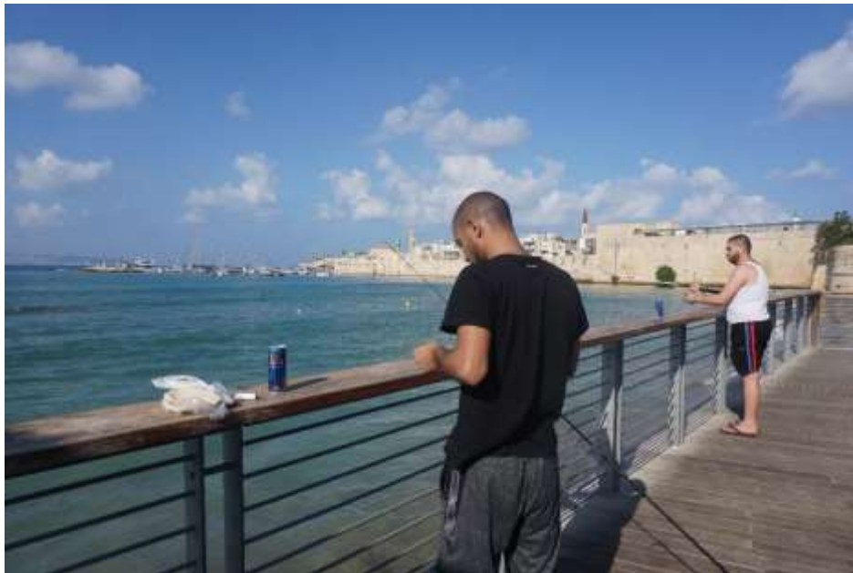
Figure 1 A view of the Old City of Akko

Situated on a peninsula, on the northern coast of Israel alongside a natural harbor of the eastern Mediterranean, Akko is adjacent to ancient international crossroad (Waterman, 1969). As a result of this geographic location the city became a trade center in ancient times. The urban space is limited due the fact that it developed on a peninsula. Therefore, the city developed in layers, the Crusader city first, and above it the Ottoman layer. Twice in its history, Akko became an international city - in the thirteenth century, as the Crusader capital city of the Latin Kingdom of Jerusalem and in the nineteenth century, under El-Jazzar Pasha, the Ottoman ruler. Despite the many years that have passed, authentic archaeological and historical evidence from these two periods remain in the city. It is within these remains, that modern life continues to this day. Within these archaeological remains and the historical space people live and work today. Within the city resides a multi-cultural population. It is vibrant and has a unique character (Peleg, 2017). The current population in the Old City of Akko consists mostly of an Arabic Muslim traditional society, which is primarily of a low socio-economic status. This blend of archaeological historical layers from the past and modern life, exist together and nourish each other, contains archaeological remains and a historical space in which people live and work.