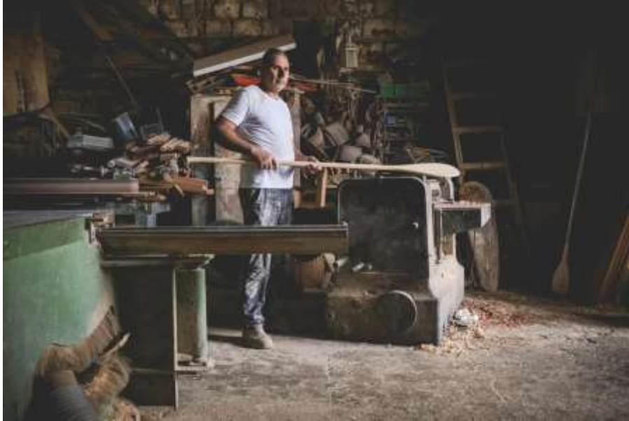
Figure 7: A local workshop for boatbuilding

In 2011 Carlos and Mali Cortes - Mali originally from Cleveland, Ohio and Carlos from La Serena, Chile, both Jewish - purchased the building from the Qassem family 105 . The house, that features historic elements dating back to the Crusader era, was run down, with outdated and dangerous infrastructures and a roof that was on the verge of collapsing. Carlos and Mali renovated it, with the timely assistance of local artisans well-versed in the complexities of stabilizing, cleaning and replacing the local Akko stone. At the risk of unearthing too much history, lest the discovery of antiquities scrap the entire project. Carma's neighbors lended a helping hand where needed or just a nice cup of local coffee and light conversation. Finally, when Carma officially opened in September 2017, the owners felt that: "inside the house you can literally touch history spanning four different periods" . These include the upper part of a 1000-year-old Crusader arch, the rest of which lies deep below ground. Various other archeological elements uncovered during renovations offer an enchanting look into how people lived hundreds of years ago. During the Ottoman Period, the townhouse was in the heart of the small Ottoman Jewish community in the great Mubellata Quarter.