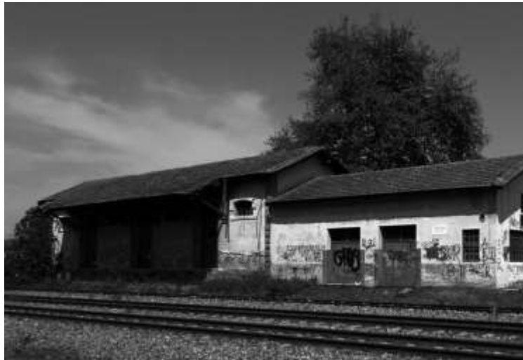
Fig. 11. Exterior view of the building's current condition [25].

ferent architectural morphology, as well as the surrounding space between them. The first building was constructed in parallel with the old building of the Karditsa railway station in 1885, by Italian engineer Evaristo de Chirico (Fig. 11). It was a commodities warehouse of the railway station and is now converted into a restaurant. The second building, constructed more recently, was a warehouse and is being reused as a covered municipal market for fresh produce. The idea of transforming part of the buildings of the Railway Station at Karditsa aims to activate some dormant building shells, so that the place acquires new uses of social content and distinct significations [25]. The design project (entitled Revival of the institution of the Municipal Market in a space of transitions: Reuse of the Karditsa Railway Station buildings) aims to create localized functions of high density and accessibility: a covered municipal market and a dining facility at a site of constant transitions.