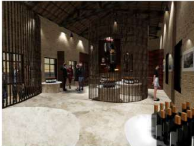
Fig. 7. Interior views [23].

The location of the Votrys plant is quite central, since it is located between Kifissos Avenue and Liosion Street, near the “Three Bridges” site, while the region is rich in school activities since there are four schools (2 primary schools, 1 middle school, and 1 high school) within walking distance from the factory. Thus, coupled with the fact that the specific area of the Municipality of Athens features no other such space, it is proposed that the site be used as a cultural center, but also as a plot of green, giving visitors and residents the opportunity to discover creative activities in a space that encourages its appropriation by various different groups of users, allowing intermingling and human exchange.