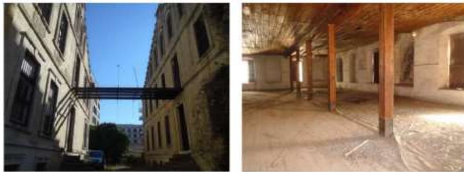
Fig. 8. Exterior and interior views of current condition.

The Sidiropoulos tobacco warehouses are a site comprising three detached stone buildings of folk neoclassical architecture (Fig. 8), featuring elements of eclecticism or German neoclassicism, very thick outer walls, wood-case windows with iron grates, heavy metal doors, rectangular or arched transoms and roofs with Byzantine or Roman-type tiles. Inside the buildings (Fig. 8), the large spaces without partitions feature wooden floors, props, beams and stairs.