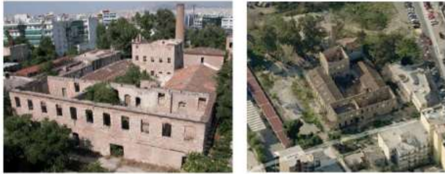
Fig. 5. Exterior views of the complex's current condition.

Skouze Hill, the Lanaras textile factory in Kolokynthou – all employed a large number of workers, creating the conditions for the development of public housing.