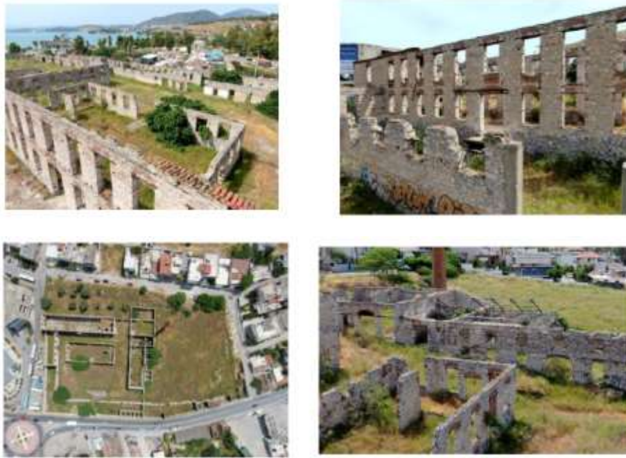
Fig. 2. Exterior views of the complex's current condition.

In the proposal [22], the site is not restored as a structure, except only selectively. It functions as an empty container that is ready to be filled, welcoming and incorporating various distinct activities – cultural events, trade expositions, art exhibitions and installations – in parallel with its permanently established functions (Fig. 3). Glass roofs and sides bring light into the space, reducing the sense of spatial boundaries, mitigating the additional material footprint, and leaving the gaze unobstructed to wander about the restored materiality of the ruins of the building, ultimately intensifying the impression of an intangible vacuum and effuse space (Fig. 4). In this architectural landscape, the same mission is fulfilled by the ramp traversing the space, guiding the routes and paths of workers and visitors alike, linking together the various different levels of the building's remains (Fig. 3). The ramp spirals around the emblematic chimney stack and the building which is being restored to house the permanent and auxiliary support functions, bestowing a quality of film direction to the human figures walking along it. In this way, the cost of repairs is reduced and the space is afforded a distinctly open, “antimuseum” form.