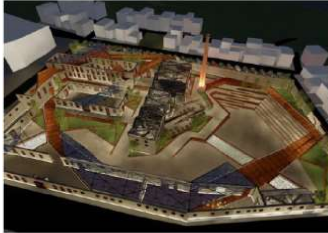
Fig. 3. Aerial night view of the center [22].