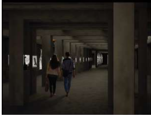
Fig. 16. View of the interior colonnades [26].

It preserves the plasticity of an architectural assembly in progress, which retains the remaining traces of past industrial activity, while receiving and hosting the twists and turns of artistic events, participating in the creation of a new cultural signification (Fig.16). This is a dynamic transformation that encapsulates, contains and highlights the legacies of the past.