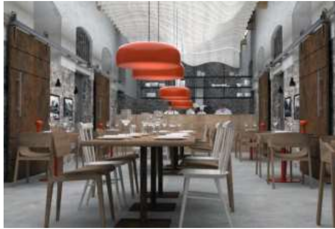
Fig. 12. Interior views [25].