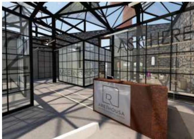
Fig. 4. Interior views with the solar protective glass [22].