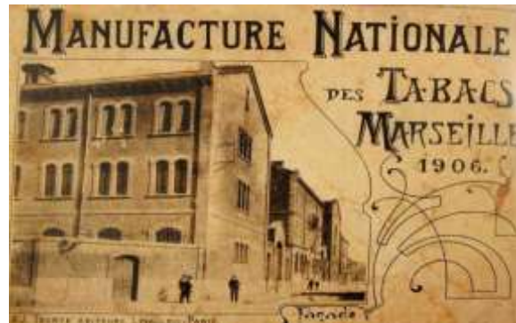
Fig. 1. SEITA tobacco factory.

act revolves around settling into a repurposed architecture... this process of sedimentation is a form of creation and a complete qualification of the space. It's not only a modification; it's a mutation. The space is no longer experienced the same way, there are different things inside; we play with scale differently, change the meaning, and starting with what was a large, poorly defined, purely functional volume, we've gradually managed to produce a regenerative recreation that no one would have thought possible." [1].