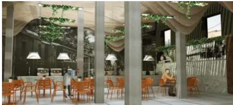
Fig. 13. Interior views [25].

The design is inspired by the fluidity of the masses of the Agrafta mountain range (Fig. 13). Hillsides and plateaus are captured in a three-dimensional model of the mountain range, which ties together the different buildings, affording the place a pulsating organic unity.