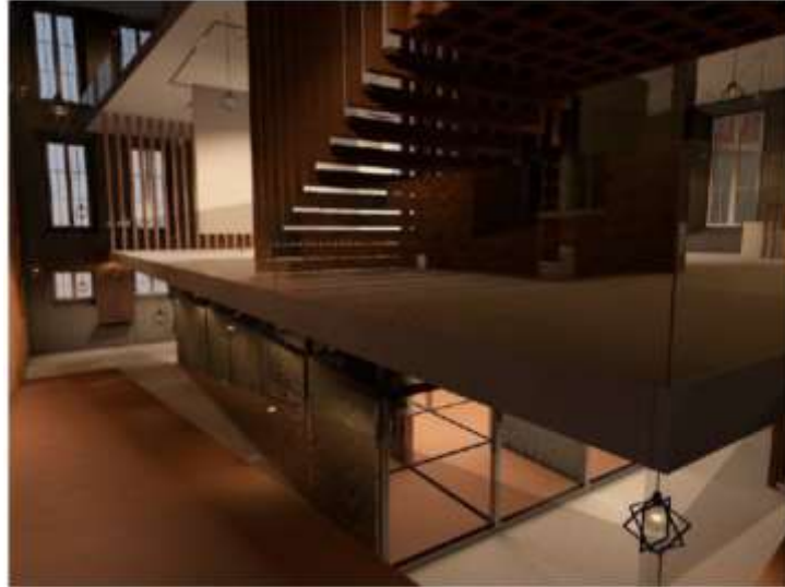
Fig. 9. Interior views [24].