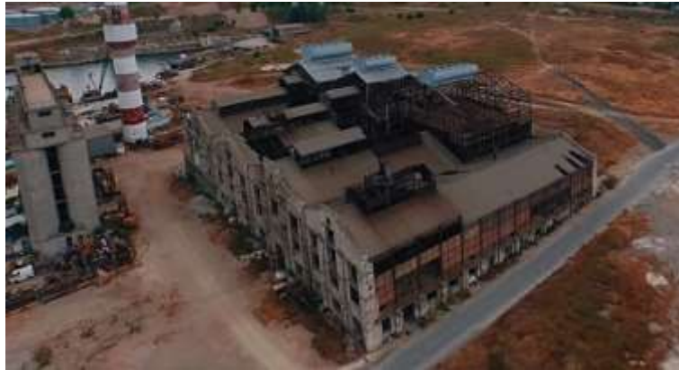
Fig. 14. Aerial view of the building's current condition [26].

The Glassworks [26] forms the epicenter of a comprehensive design, which unfolds beyond the boundaries of the building. The respect for the memory of the place leads to a reversible intervention, which does not affect the existing situation. Thus, a metal frame is added inside the building, around the old equipment and without coming into contact with the building shell, which forms a pathway that traverses the building and unifies its various different levels. The Glassworks, which preserves the memory of its previous function as an integral part of a larger industrial complex that included a series of interconnected production processes, constitutes a hub and a station along a course that runs parallel through time and space (Fig. 15). The building as a landscape of continuous, permanent or ephemeral cultural activities does not claim autonomy as a structure and is not completed as a construction.