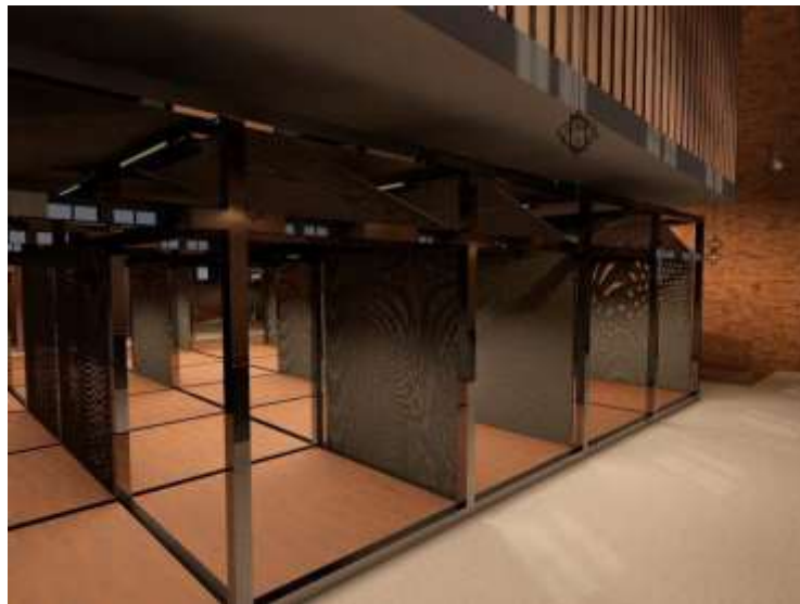
Fig. 10. Interior views [24].

The intent of the design marks a 180-degree turn, both literally as it proposes the radical change of the building's mission (Fig. 10), use and content, and metaphorically, as the syntactic structure of the interior is inspired by the geometric relation among the buildings from the outside.