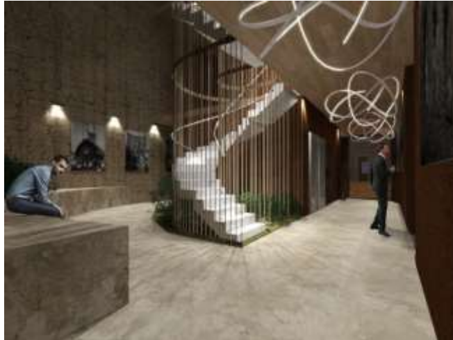
Fig. 6. Interior views [23].