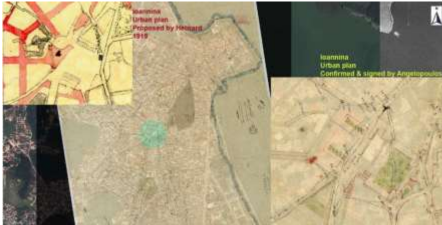
Fig. 1. Screenshot from GIS developed for IASIS project. Layering of the ortho imagery 2015 with the urban plan of Ioannina/1915/Approved and signed by Angelopoulos. The green coloured area indicating the site represented in detail images, as parts of the urban plan of Ioannina/1915/Approved and signed by Angelopoulos (bottom right corner) and the urban plan proposal of Ioannina/1919/Implemented by Hébrard (up left corner). [Imagery source: © 41, © 31, © 29] Digital processing by Athina Chroni.

All the buildings are located at the same site, [Fig. 1] outside the Castle of Ioannina, in the suburbs of the former Byzantine, later on Post-Byzantine city of Ioannina, nowadays the center of the modern town, forming a stratigraphic and cultural palimpsest, thus reflecting the respective political and social alterations, revealing the pluralistic physiognomy of the city.