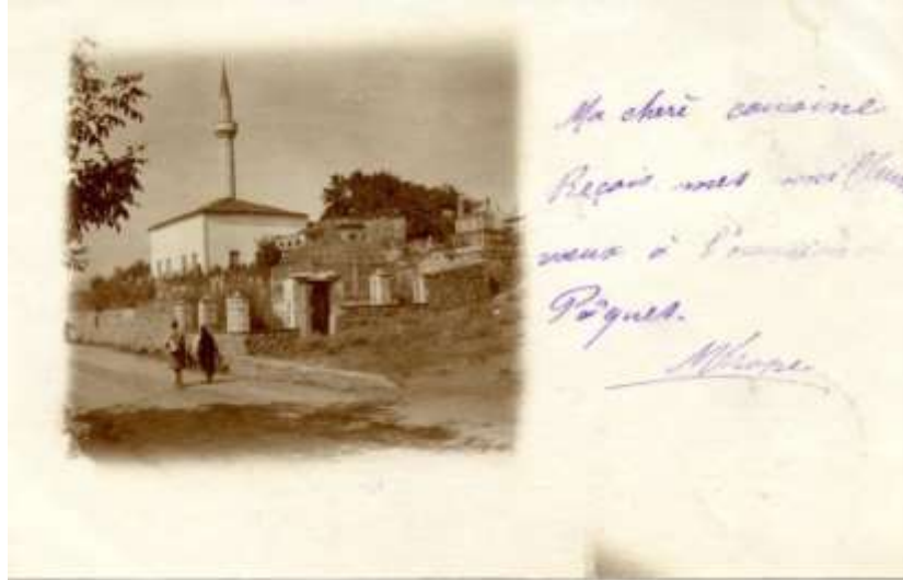
Fig. 3. Namaz Giyah Muslim mosque. View from the northeast. The specific photograph constitutes the only datum, detected so far, depicting the mosque minaret's conical roof. Postal card of unknown date and publisher.