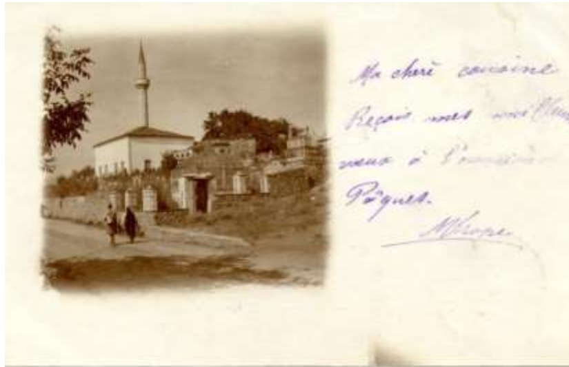
Fig. 3. Namaz Giyah Muslim mosque. View from the northeast. The specific photograph constitutes the only datum, detected so far, depicting the mosque minaret's conical roof. Postal card of unknown date and publisher.