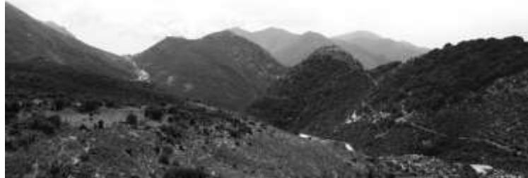
Fig. 1. General view of the area of Tetrachori of Souli

natural environment. The area is a "historical place" and "cultural landscape" as it has settlements that maintain distinct historical traces and historical fortifications.