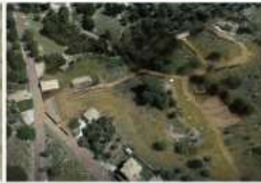
Fig. 7 Promotion of public space, Center of Souli, 3d rendering

Visitors can move through the new path created, through this small square, to the old path revealed by research, towards the old main path that leads North to the "Center" of Souli and South to "Koulies". The area of Koulies (South Towers) is one of the most impressive sites in terms of view, as it "supervises" the entire history of Souli, from Kougi to the Castle of Kiafa. The place is proposed to be used as an observatory.