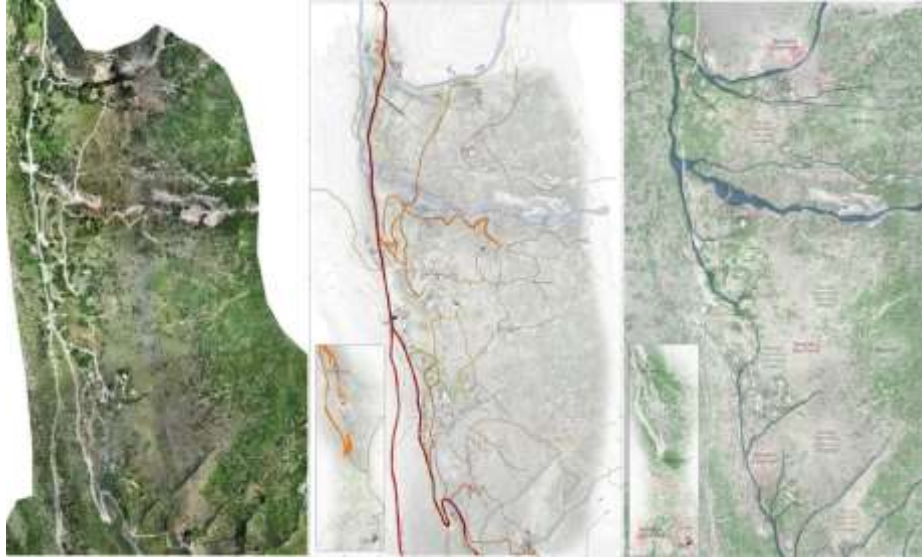
Fig. 2 Orthophoto map of Souli settlement, scale of 1:1000