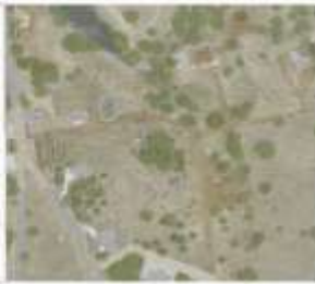
Fig. 6 Promotion of public space, Center of Souli, plan 1:200