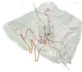
Fig. 10 Road network interpretation_Kiafa, 1:2000

Although, the most important event in the landscape is the ascent to the Castle of Kiafa, which dominates the area metaphorically and literally. In the course of the path, that leads from the area of the wells and the trees to the two gates of the castle of Kiafa, one can find the ruins of the church of Ag. Constantine's and Eleni (11a, 11b).