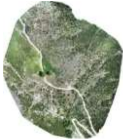
Fig. 8 Orthophoto map of Kiafa, scale 1: 1000