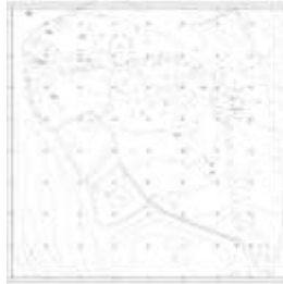
Fig. 5 Topographic plan, 1:200