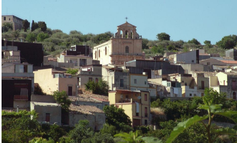
Fig. 3. Historical centre of Ferla, Sicily.

Together with the integration of RES, the Municipality of Ferla promotes measures to improve the waste reduction rate and the distribution of free drinking water. These actions are aimed towards the ecological transition, with the fulfilment of CE and sustainable lifestyles, but also and foremost favourably impact the quality of life and well-being for residents within the village, social cohesion, innovation and fair employment. These side benefits do not come as a surprise: as a matter of fact, the primary purpose of Energy Communities is to provide environmental, economic and social community advantages for shareholders and members, as well as for the local areas where they operate, with the additional contributing factor given by financial profits [29].