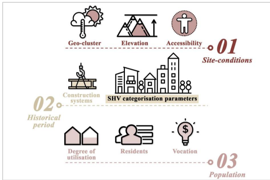
Fig. 2. Proposed main categorisation parameters for small historical villages.

Among those parameters belonging to the first category, some significant ones could be: 1) geo-cluster , based on the usual definition of European climatic zones (Köppen climate classification); 2) elevation , which typically refers to their height above sea level and the geomorphological typology of the area (mountain, hill, plain or coastal villages) 4 ; 3) accessibility , which relates to distance from main urban centres, easy and convenient access to public and private transport, but can be also extended to digital and communication service availability (i.e. access to internet).