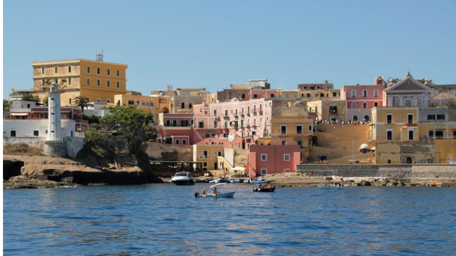
Fig. 4. Ventotene, small island in the Tyrrhenian Sea.

fostering a shared sense of belonging for the community as a whole; these experimentations were integrated with activities aimed at raising awareness and providing education on environmental-responsible behaviours.