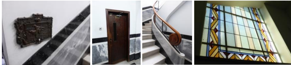
Fig.7. (Left) Bronze apartment bells, Fig. 8. (In the middle-left) Wooden elevator doors, Fig. 9. (In the middle-right) Cast iron balustrade with wooden handrail & Fig.10. (Right) Stained glass

The 1st, 2nd & 3rd Floor Apartment. The apartment building consists of four floors, 1st, 2nd, 3rd and 4th (penthouse apartment), an elevated ground floor and a semi-basement. Each floor is a separate large apartment (five apartments in total), while the ground floor apartment has independent entrances, not through the main entrance of the building. According to the apartment building internal regulation, the apartments can only be used as residences. The building has been erected on a plot of land, with an area of 662.87m 2 , and is adjacent to the street line, while it is located at a distance from the lateral boundaries, leaving uncovered space in the eastern part of the plot.