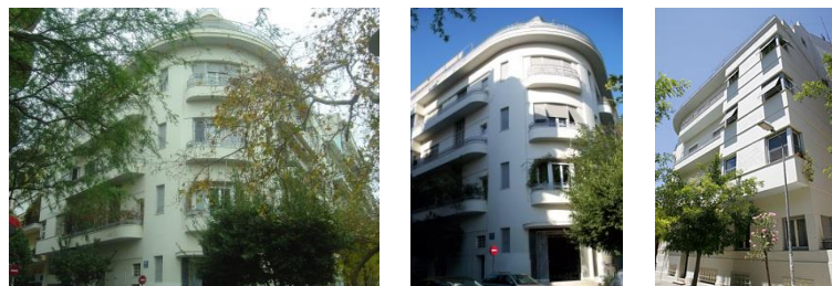
Fig. 1. (Left)[12], Fig. 2. (In the middle)[13]& Fig. 3. (Right) [14] Aspects of the Lanaras Family's Apartment Building

Lanaras Family's Apartment Building. Address: 23, Fokionos Negri Street & 46, Eptanisou Street, Kypseli, Athens. Date of Erection: 1937-1938