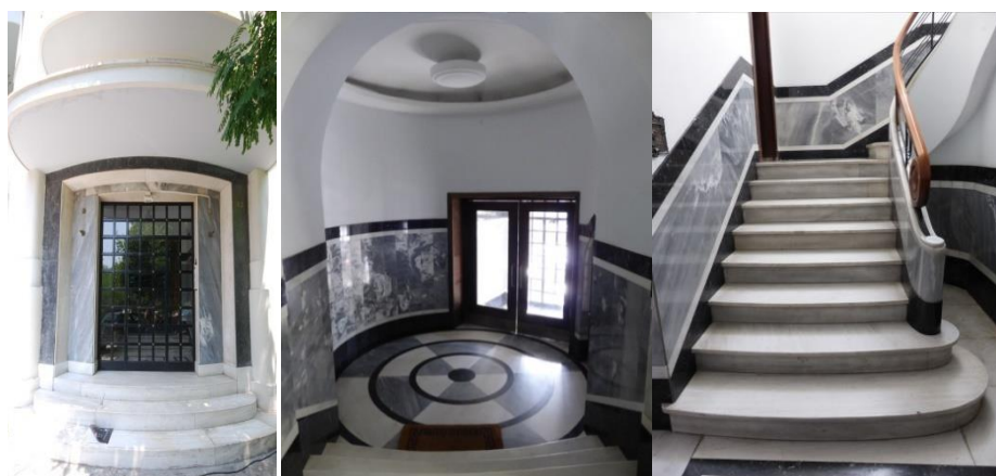
Fig. 4. (Left)The main entrance, Fig. 5. (In the middle) The vestibule and the central hall& Fig. 6. (Right)The main staircase

The vestibule and the main hall are decorated with white, gray and black marble, with elaborate floor and wall design (Fig.5). The staircase (Fig.6) is impressive, also decorated with the same types of marble and has bronze sconces and apartment bells decorated with animal designs (Fig.7), cast iron balustrade with wooden handrail (Fig.9) and stained glass in the openings (Fig.10). The entrance doors of the apartments are solid dark wood with glass opening. The elevator doors are also wooden (Fig.8).