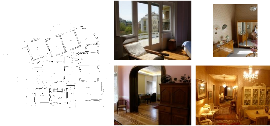
Fig.11. (Left) Floor plan of the 1st, 2nd & 3rd floor apartment (Archive of G. Eleftheraki), Fig.12.&13. (In the middle up & down) Interior views of the 2nd floor apartment (Archive of G. Eleftheraki, ©P. Tranidou), Fig.14.&15. (Right up & down) Interior views of the ground floor apartment (Archive of G. Eleftheraki)

The "Public" Space of the Apartment. The entrance – hall introduces the visitor to the apartment and the reception areas, the main living room, the separate living room (with the stained glass) and the dining room they have access to each other, that is, they are rooms-passages of primary use, where movement and function are correlated (Fig.13). Their proximity to the entrance and their placement facing Eptanisou Street, so that they have access to natural lighting and ventilation, are the translation of their "public" position in the floor plan of the apartment.