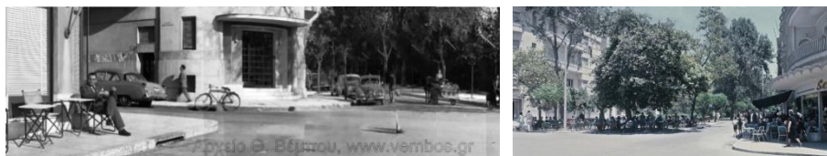
Fig.16. (Left) Stills from the film "Neither cat. Nor damage" ( "No harm. No foul" ) (1955) [20], Fig.17. (Right) Panoramic view of Fokionos Negri from the height of Eptanisou Street in front of Select (1964) [21]