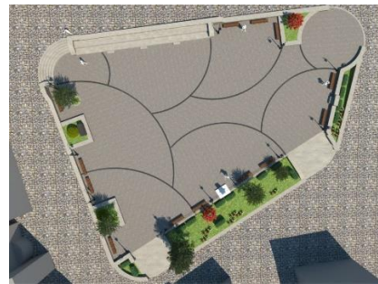
Fig. 15. Redesign of Emmanouil Brothers Square, 2021.

Another crucial chapter in the design of the squares is urban equipment. Except for Emporiou Square, the selected spaces display a beneficial installation of a minimum of elements (benches, tree tubs, bollards, light posts, litter bins, and occasionally drinking