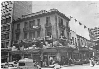
Fig. 12. Typical building on the perimeter of Emporiou Square in the 1980s, with shops on the ground floor and offices further up.