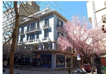
Fig. 13. The same building today, with a cafe - restaurant on the ground floor and a hotel on the upper stories.