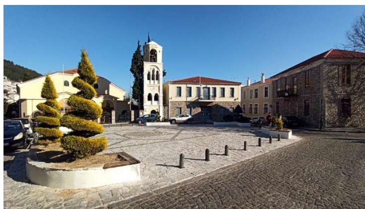
Fig. 3. Metropolis Square.