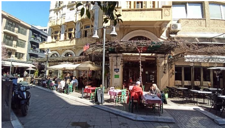
Fig. 19. Emporiou Square, view of the impact of recreation on a listed building.