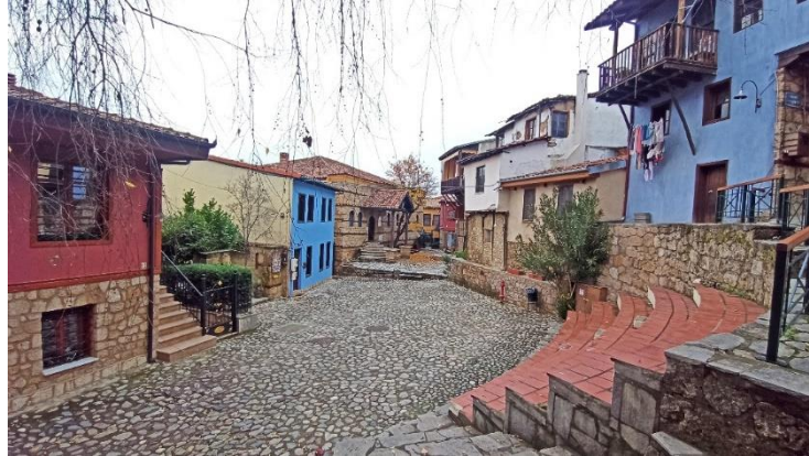
Fig. 1. Barbouta Square.