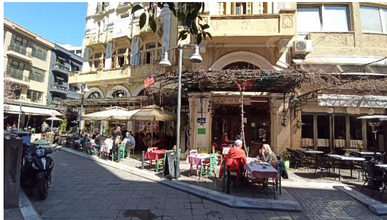
Fig. 19. Emporiou Square, view of the impact of recreation on a listed building.