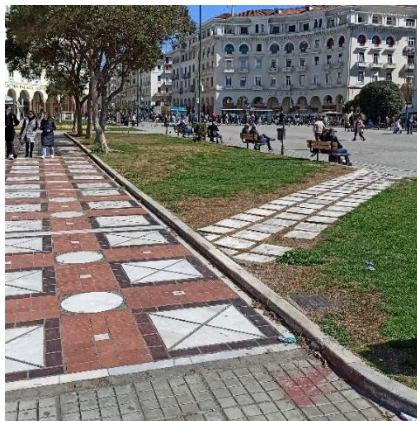
Fig. 14. Aristotelous Square, with four distinct types of paving.