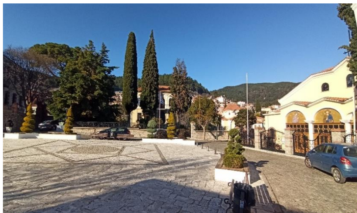
Fig. 9. Metropolis Square, view with the street to the east.