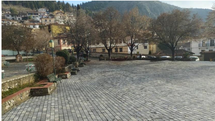
Fig. 2. Emmanouil Brothers Square.