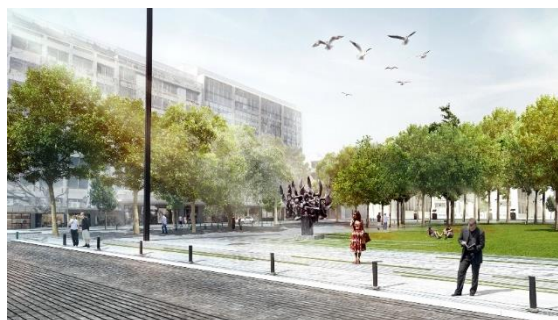
Fig. 17. Redesign proposal for Eleftherias Square, 2015.