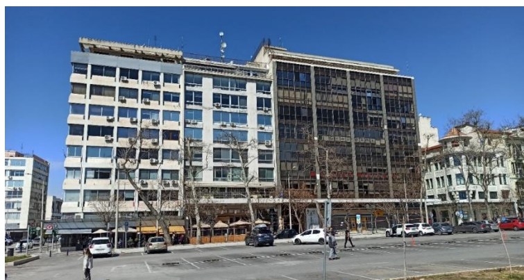
Fig. 20. Eleftherias Square, view of the fronts of surrounding modern buildings.