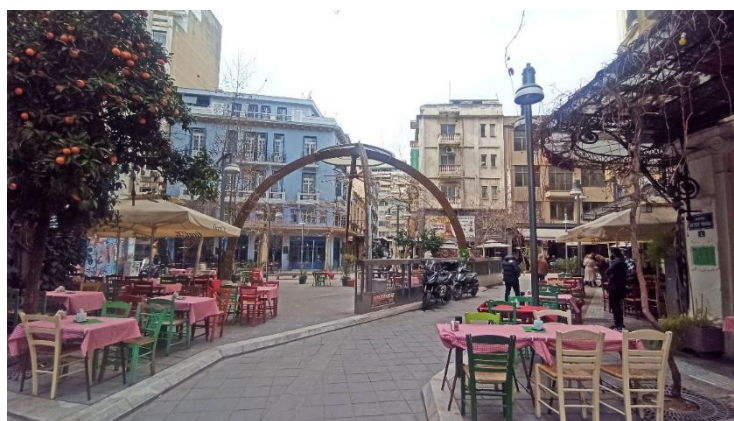
Fig. 6. Emporiou Square.