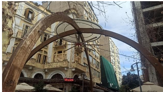
Fig. 16. Emporiou Square, view below the domed frame.

As concerns the surrounding modern structures, Aristotelous Square gathers none. In Barbouta Square, Metropolis Square, and Emmanouil Brothers Square, a positive establishment of relatively moderate fronts is noted, with a considerable margin for improvement (removal of disfiguring shelters, signs, and mechanical units). In Eleftherias Square and Emporiou Square, a similar situation remains to be witnessed, due to the vivid morphological disruption caused by the shops, cafes, and restaurants on the ground floor and the free deployment of signs and air-conditioning units on the upper floors (see Fig. 20). Hence, substantial remedial action needs to be taken, a task resting entirely with the respective owners, as are the necessary works on the historic buildings, which in absence of special subsidy schemes and collective conscience, are all too often disregarded.