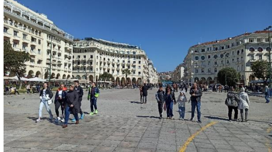
Fig. 11. Aristotelous Square.