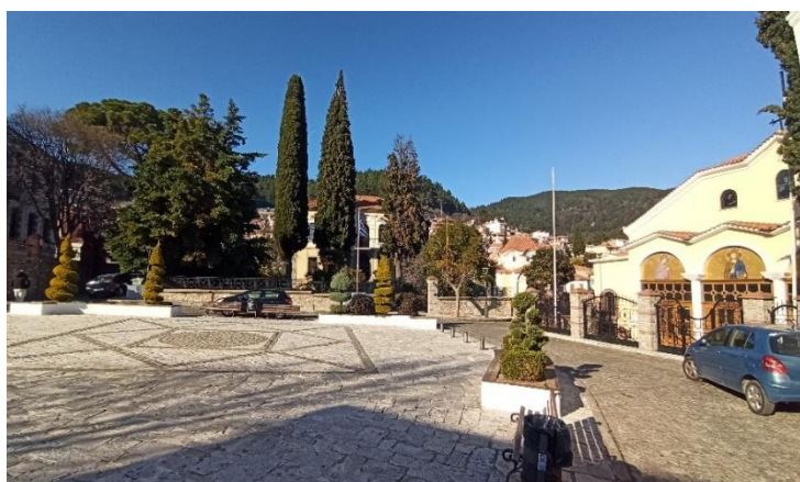
Fig. 9. Metropolis Square, view with the street to the east.