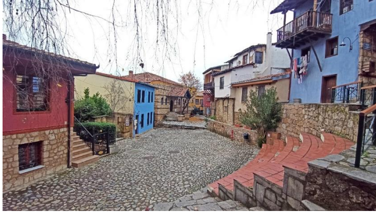
Fig. 1. Barbouta Square.