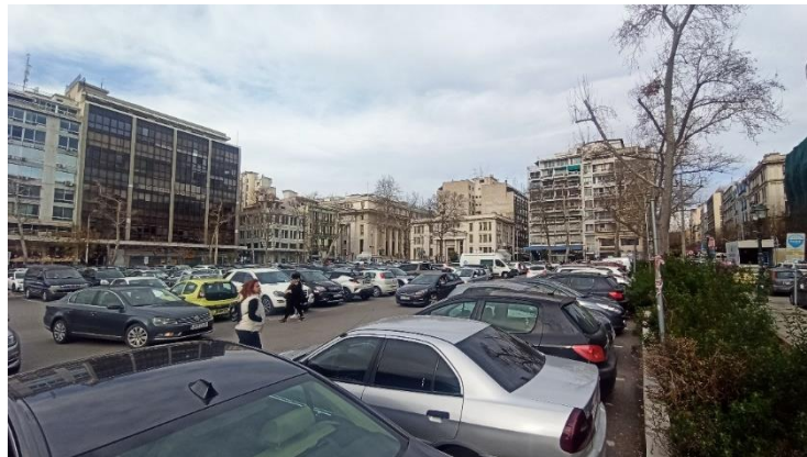
Fig. 5. Eleftherias Square.