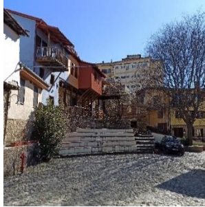
Fig. 10. Barbouta Square.