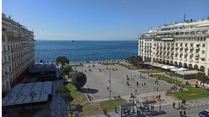
Fig. 7. Aristotelous Square, facing the sea.