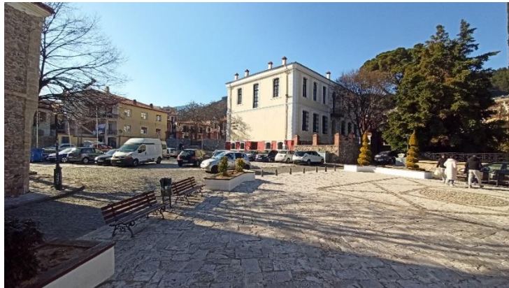
Fig. 8. Metropolis Square, view from the east section to the west parking lot.