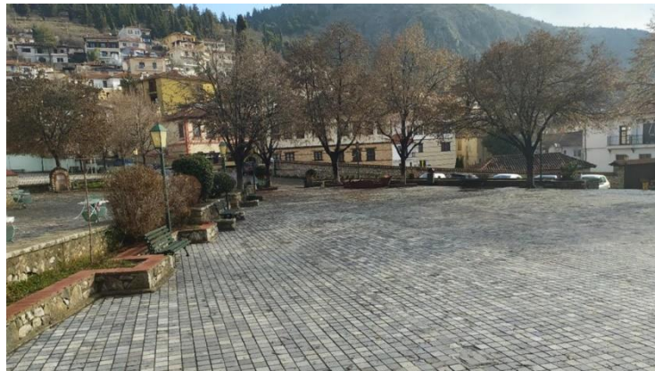
Fig. 2. Emmanouil Brothers Square.