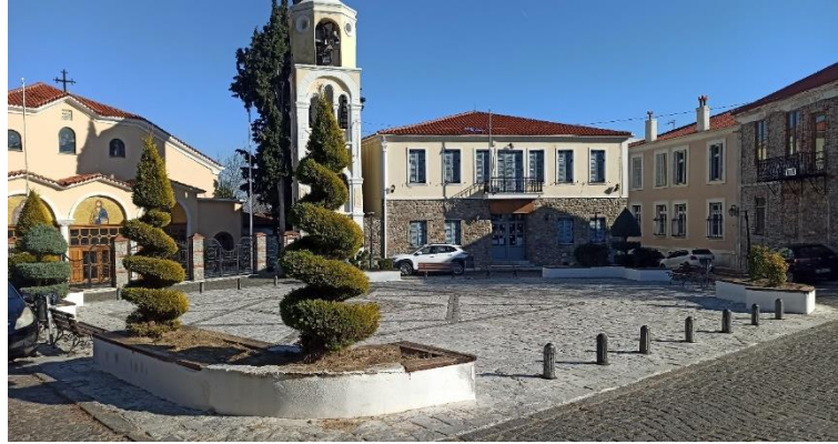
Fig. 18. Metropolis Square, with view of the surrounding building fronts.