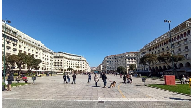
Fig. 4. Aristotelous Square.