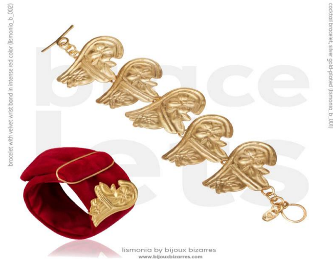
Fig. 3. Embossed ancient Greek-style by our student Panos Kardasis