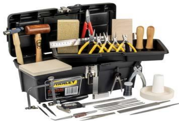
Fig. 2. The portable workshop