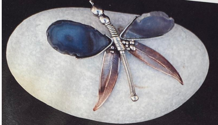
Fig. 4. Artistic by our student Beky Doriza