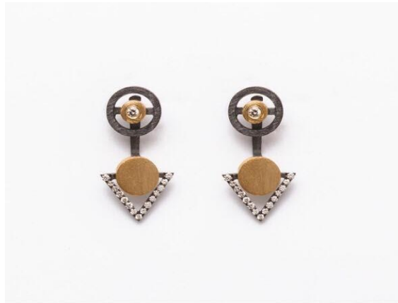
Fig. 7. Earrings by our student Evelina Papantoniou