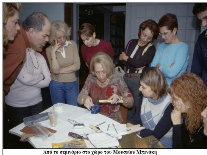
Fig. 1. The implementation of the seminar in the Benaki Museum